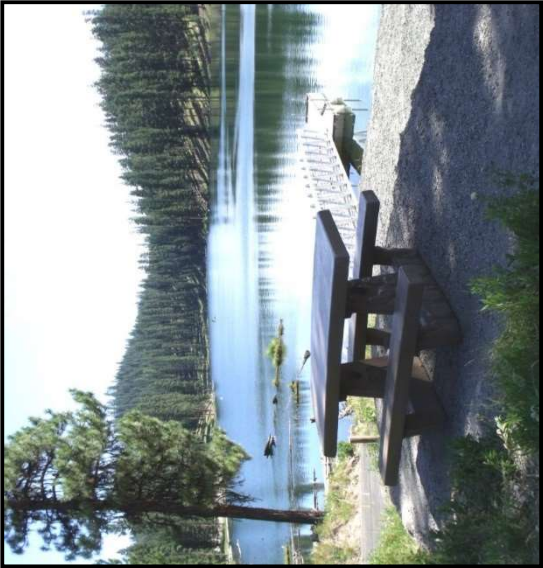
Magone Lake Campground Blue Mountain Ranger District

United States Department of Agriculture Forest Service • Pacific Northwest Region