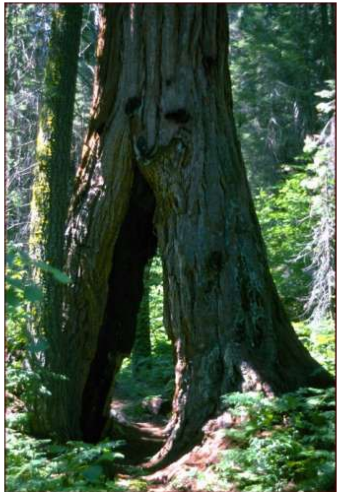
This tree is located on the Camp Nelson Trail east of Cedar Slope. Hikers, mountain bikes, and persons on horseback can pass through it's enormous trunk.

The Bear Creek Trail (31E31) climbs from Coy Flat Road to Slate Mountain Ridge along the western edge of the grove. Along this trail you'll find a group of sequoias, as well as beautiful vistas along Slate Mountain Ridge. There are three campgrounds in the area. Belknap Campground is within the grove itself, Coy Flat is adjacent to it, and Quaking Aspen is a 30-minute drive along Highway 190 to the east. These are fee campgrounds with drinking water and vault toilets. There are private cabins allowed under special use permits in two Forest Service Recreation Residence Tracts within the grove as well.