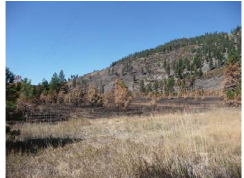
Fort Fizzle after the Lolo Complex burns through. August 10, 2013.