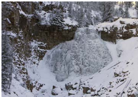
Rustic Falls, Yellowstone National Park