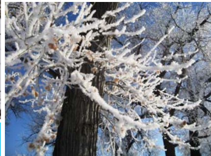
Hoarfrost on Cottonwoods at Bear Paw Battlefield.