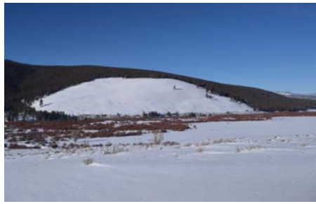
Big Hole Battlefield near Wisdom, MT.