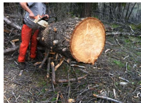
US Forest Service Images courtesy of the Bitterroot National Forest