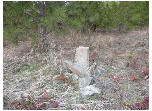
Cement marker at Fort Fizzle, "Soldiers Corral." April 5, 2013.