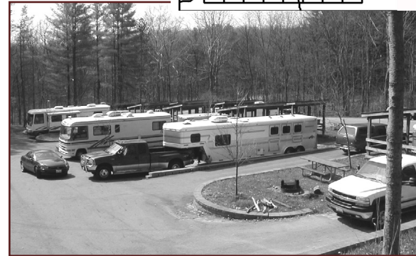
Stone Church Horsecamp vicinity map and photograph of campground.