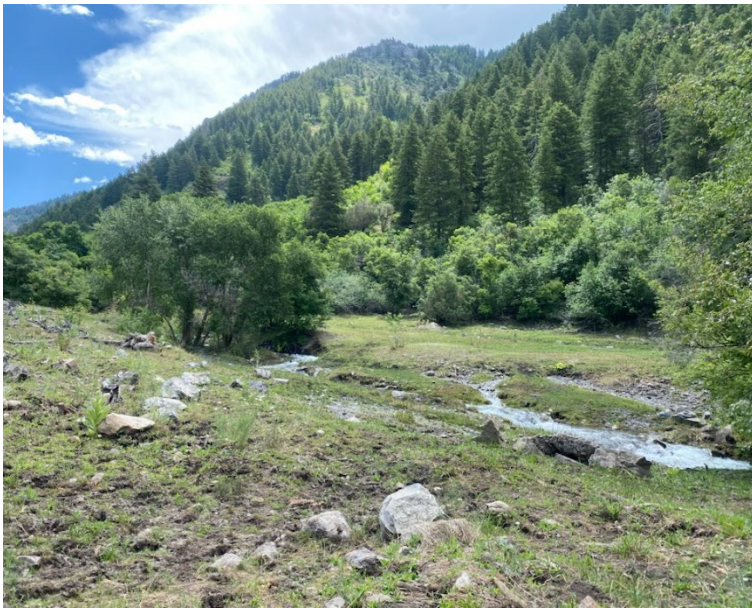
The forest is green, and the wildflowers are beautiful.

Firewood permits for the Logan and Ogden Ranger Districts are available to purchase now. Permits this year allow harvesting of wood that is dead and standing or dead and down. A permit will allow you to harvest wood within the areas shown on the 2023 Logan and Ogden Firewood Cutting Areas Map. All permits sold are valid until November 15, 2023, but permits could sell out before then. Come and get yours now!