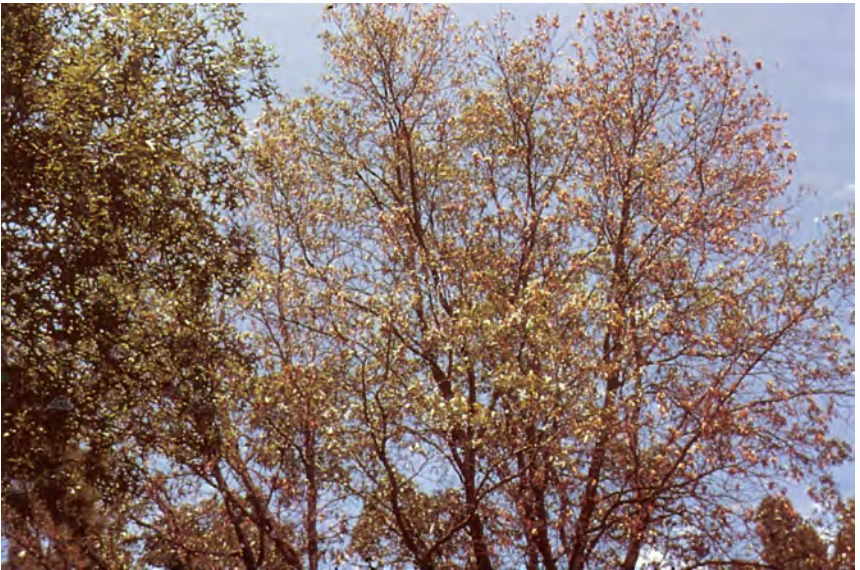
Figure 3. — Oak wilt symptoms.