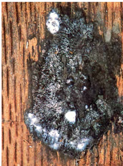
Figure 4. — Fungus mat.