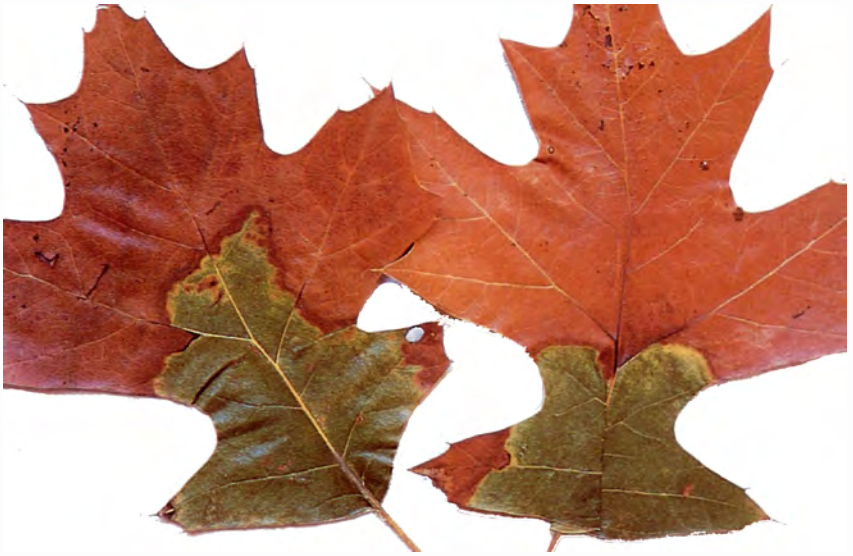
Figure 2. — Oak wilt symptoms on red oak leaves.