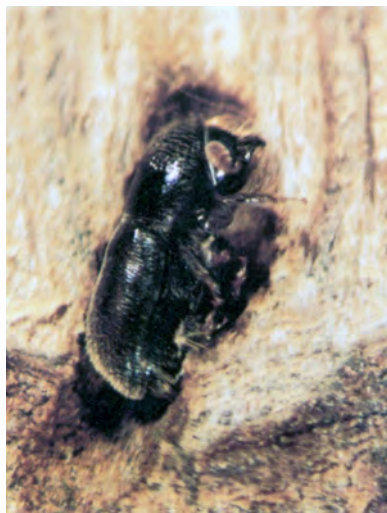
Figure 8. —Oak bark beetle egg galleries.