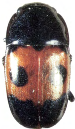
Figure 7. —Sap-feeding beetle. F-703172

trees to wounds on healthy oaks, the disease-causing spores are transmitted to a new host.