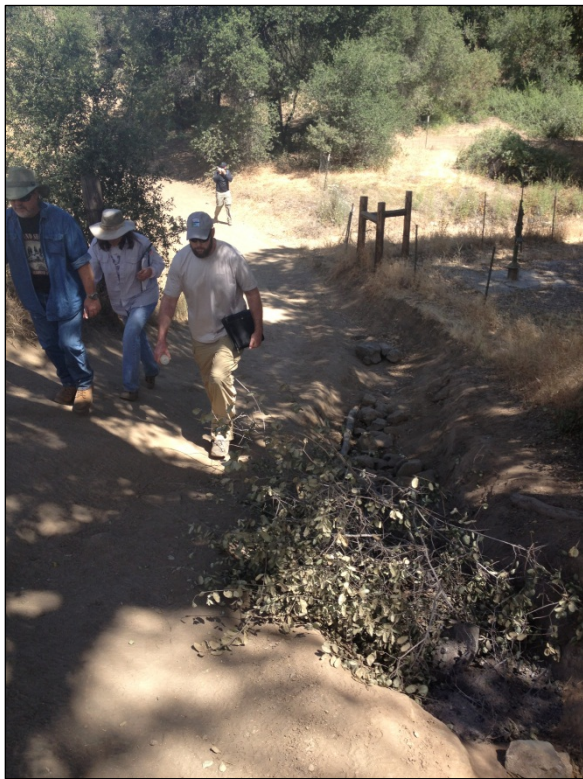
The Monitoring Team climbs up an OHV trail alongside the gully that contributes sediment to a stream adjacent to Corral Canyon Campground.

Ensure that NEPA decision documents clearly convey the instructions for all components of a project. Perform annual monitoring to evaluate soil erosion throughout the Corral Canyon OHV Area, and seek funding for tread maintenance to repair existing issues, like the gully adjacent to the campground, and prevent future issues. Seek funding to decommission unauthorized routes.