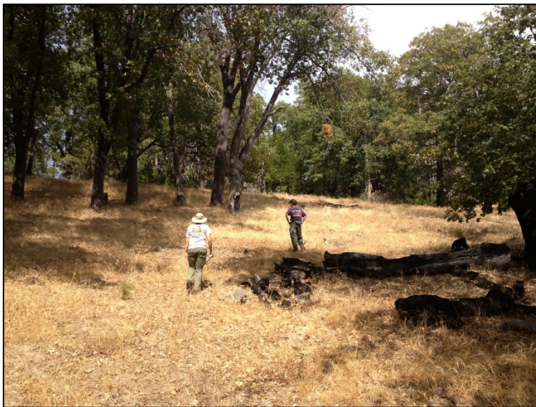
The Monitoring Team searches for surviving seedlings from a reforestation effort on Palomar Mountain.

Ensure that project Purpose and Need are clearly outlined and agreed upon by all project staff. Refer to the signed Decision document before implementing the project to avoid going beyond authorized project boundaries. Initiate replanting efforts swiftly after wildfires to promote survival, and focus on areas that are deforested or understocked and in need of reforestation, following prescribed reforestation procedures. Promote coordination among resource and fire management staffs for both planning and fieldwork to avoid conflicting activities.