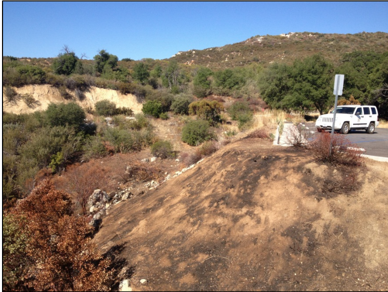
The slope below the parking area at Henshaw Scenic Vista was burnt in a July 4, 2013, wildfire.

Continue periodic checks of the location to report any potential problems with sanitation. Evaluate the potential for installation of a toilet at the site if funding can be identified.