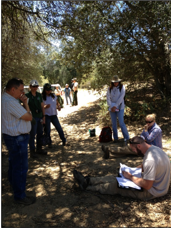
The Monitoring Team assesses the maintenance of Long Valley Loop Road.