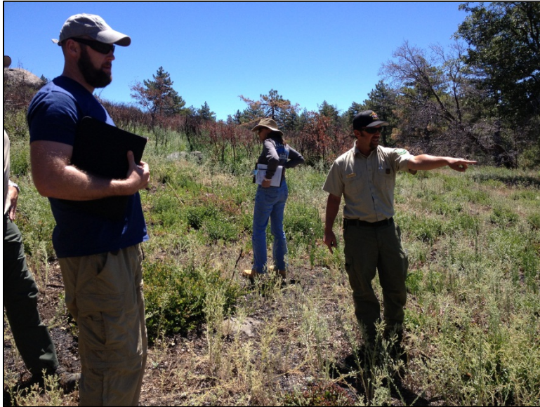
The detailed District Battalion Chief describes the Wooded Hill prescribed burn to the Monitoring Team.