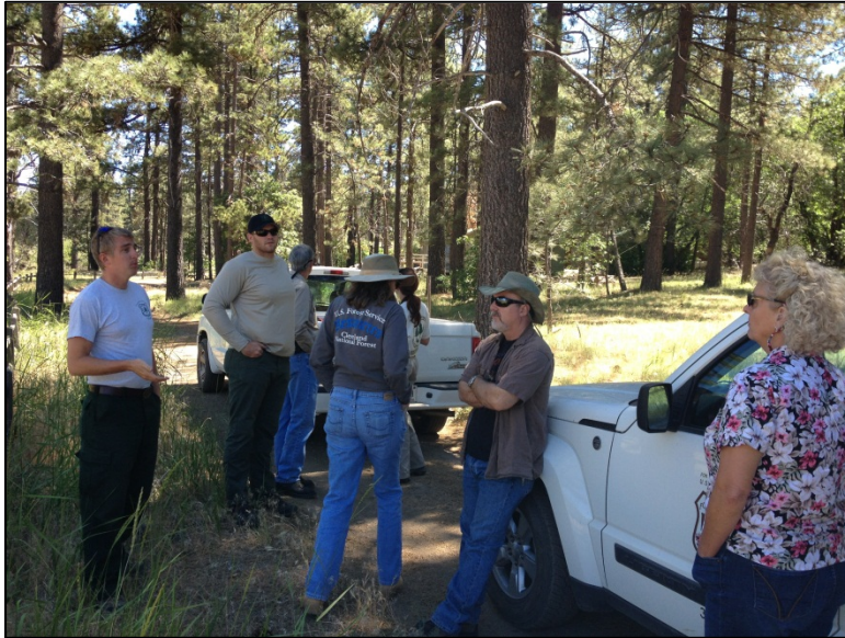
The District Recreation and Lands Officer describes the management of the Laguna Recreational Residence Tract to the Monitoring Team.