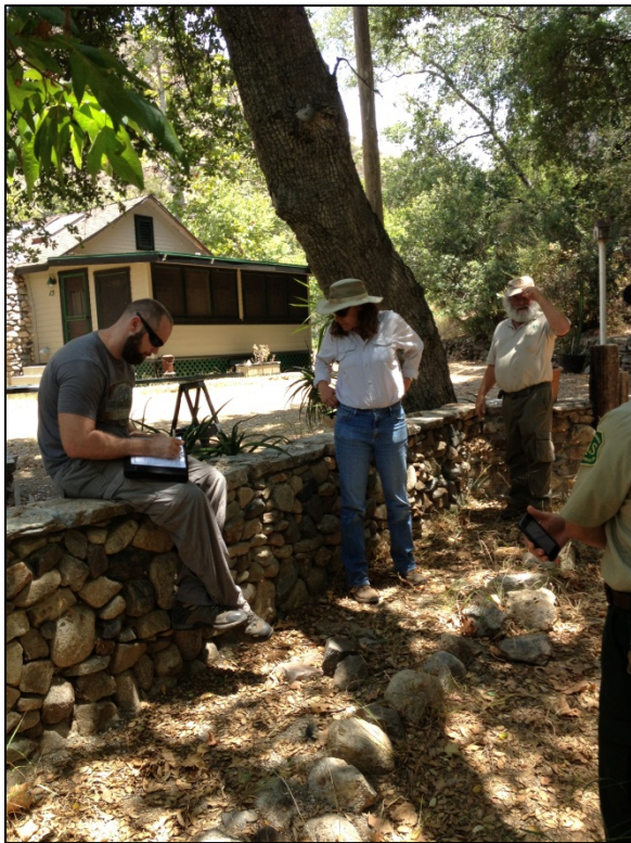
The Trabuco District Ranger and Monitoring team assess the San Juan Recreation Residence Tract.

The Trabuco Ranger District should continue managing this tract in the direction of full compliance and desired conditions. Funding should be sought for invasive weed treatments and building foundation removal.