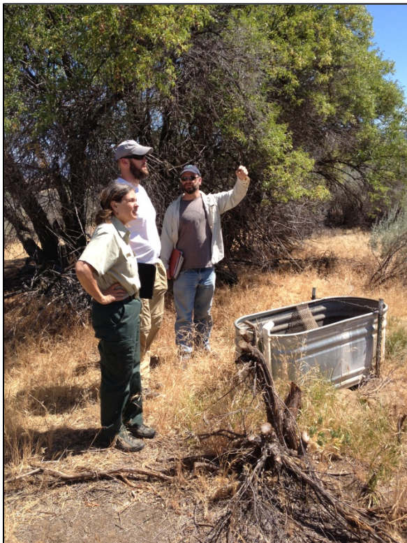
The Warner Ranch watering trough is described to the Monitoring Team and Palomar District Ranger by the Forest Grazing Program Manager.

Continue to manage the allotment to standard.