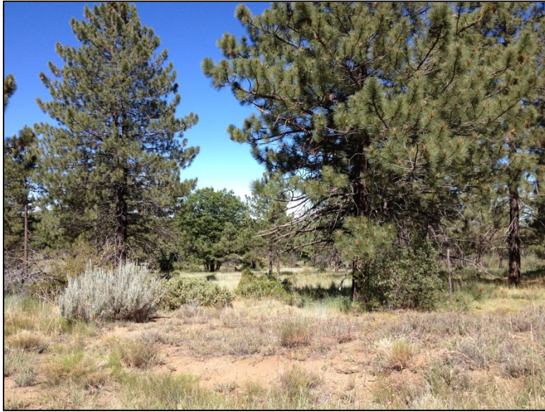
The Laguna Allotment as seen from Kitchen Creek Road.