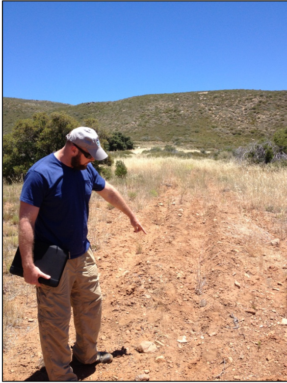
The Monitoring Team Hydrologist points out trenches left behind by the decommissioning of an unauthorized route off Deer Park Road.