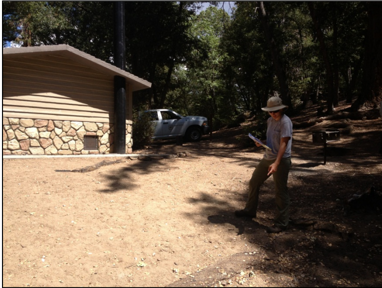
The Forest Hydrologist shows a wattle left behind to control erosion after the upper restroom was installed at the Fry Creek Campground.