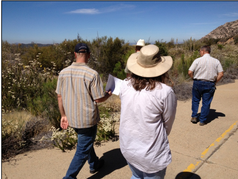
The Monitoring Team surveys the control of invasive Spanish broom along Los Terrenitos Road.

Continue to monitor the site for new infestations and retreat as necessary.