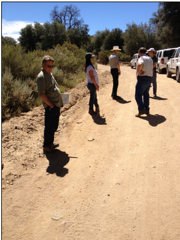
The Monitoring Team and Descanso District Ranger evaluate soil erosion on Bear Valley Road.

In order to comply with Best Management Practice requirements for roads, a decision should be made about whether to close Bear Valley Road regularly after wet weather, ensure that maintenance occurs every year, or redesign the road to withstand wet weather use without compromising water quality.