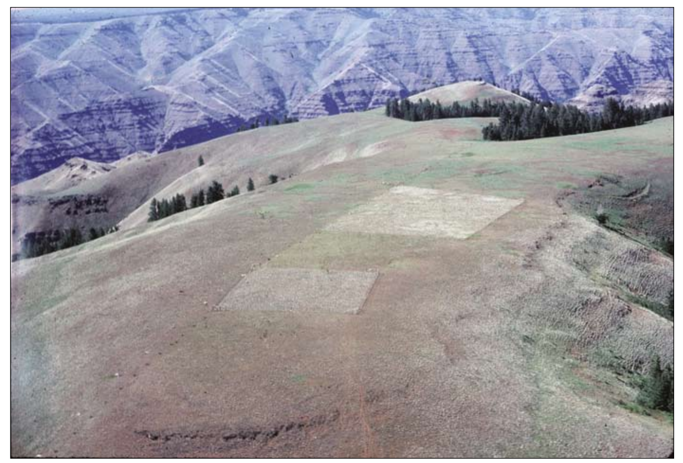
The Grizzly Ridge three-way exclosure, Hells Canyon National Recreation Area, Wallowa-Whitman National Forest. The two light-colored squares are the livestock exclosure (the larger of the two) and the game exclosure (smaller and located below and to the left of the livestock exclosure). The open (unfenced) monitoring plots are located in the foreground between the camera and the game exclosure. 27 June 1977