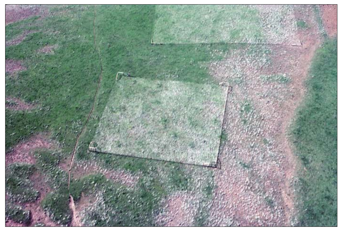
Figure 2a—The Coffee Pot game exclosure, Hells Canyon National Recreation Area, Wallowa-Whitman National Forest. The livestock exclosure is also partially visible at the top of the photograph. 27 June 1977.

Idaho fescue was co-dominant with Sandberg's bluegrass and onespike oatgrass in 1971. By 2003, Idaho fescue had dramatically increased to dominate at a cover of 26 percent. Both of the other shallow-rooted bunchgrasses were less than 5 percent cover by 2003 with the strong increase by fescue. Idaho fescue also nearly doubled in cover in the open area (11 percent in 1971, 19 percent in 2003). However, Kentucky bluegrass, common yarrow ( Achillea millefolium var. lanulosa ), and red avens ( Geum triflorum ) all made dramatic increases over the 22-year period. Although cattle use ceased in 1979, elk numbers steadily increased through the mid 1980s. The resultant bluegrass-forb-dominated open site can be attributed to the long-term grazing effects as well as the more recent grazing impacts by elk. Mormon Flat had long-term domestic sheep use prior to the construction of the exclosures and has had heavy use by herds of elk. Mountain brome ( Bromus carinatus ) and prairie junegrass have remained static throughout the sampling period on all sites here.