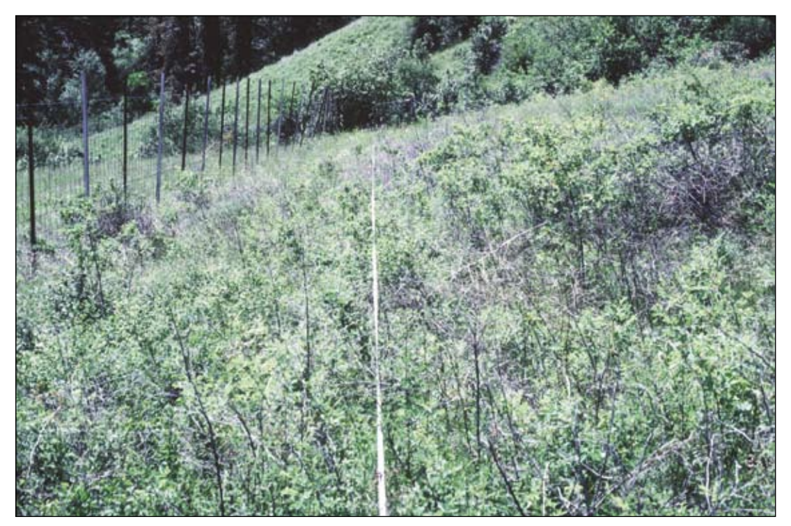
Figue 4b—The Pleasant Valley three-way exclosure on 6 June 1996. The vegetation is now dominated by rose and snowberry shrubs.