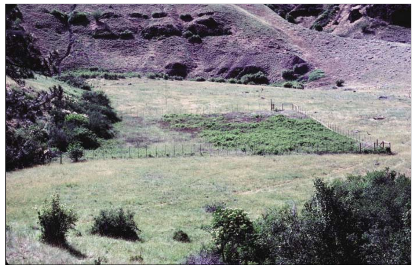
Figure 3—The Pleasant Valley three-way exclosure, Hells Canyon National Recreation Area, Wallowa-Whitman National Forest. The game exclosure (center) has been strongly colonized by shrubs. The livestock exclosure is faintly visible above the game exclosure. The open (unfenced) monitoring plots are located near the edge of the photograph to the right of the game exclosure. 14 June 1983.

Unfortunately the three sites selected are not readily comparable. The game exclosure is located with one side adjacent to a gulch where shrubs persist. Since construction in 1969, a common snowberry-rose stand has increasingly invaded the grassland of the interior that was co-dominated by Kentucky bluegrass and bluebunch wheatgrass. The livestock exclosure is a distance up the sloping bench, and in 1969 there was no snowberry or rose component. This was not due to a site difference per se. The open area was, however, offsite on a rocky promontory where bluebunch wheatgrass was dominant over Sandberg's bluegrass.