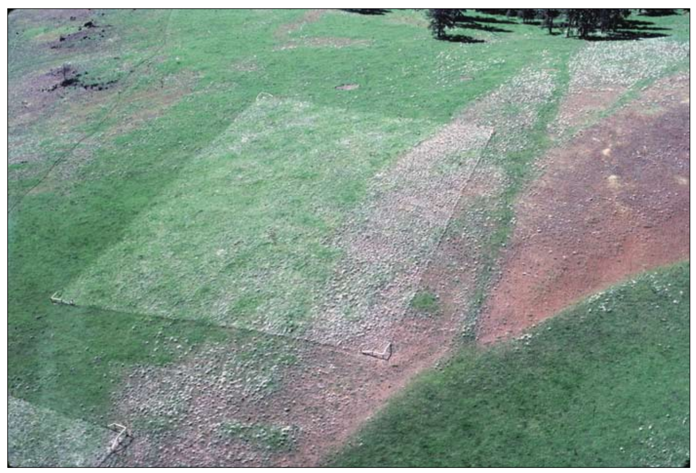
Figure 2b—The Coffee Pot livestock exclosure, Hells Canyon National Recreation Area, Wallowa-Whitman National Forest. 27 June 1977.