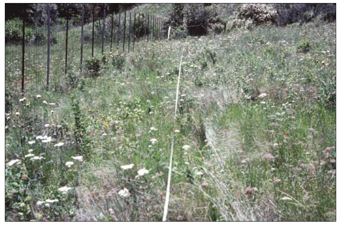
Figure 4a—The Pleasant Valley three-way exclosure on 18 June 1976. Vegetation in this portion of the exclosure was dominated by bluebunch wheatgrass. The abundant white flowers are yarrow.