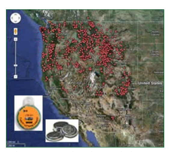
A dynamic mapping tool provides a spatial index to nearly 3,200 sites on streams and rivers in the U.S. and Canada where full year stream temperatures are currently being monitored by several agencies.

Thermal regimes are important to aquatic ecosystems because they strongly dictate species distributions, productivity, and abundance. Inexpensive digital temperature loggers (thermographs, such as the TidbiT data logger pictured at right), geographic information systems (GIS), remote sensing technologies, and new spatial analyses are facilitating the development of temperature models and monitoring networks applicable at broad spatial scales.