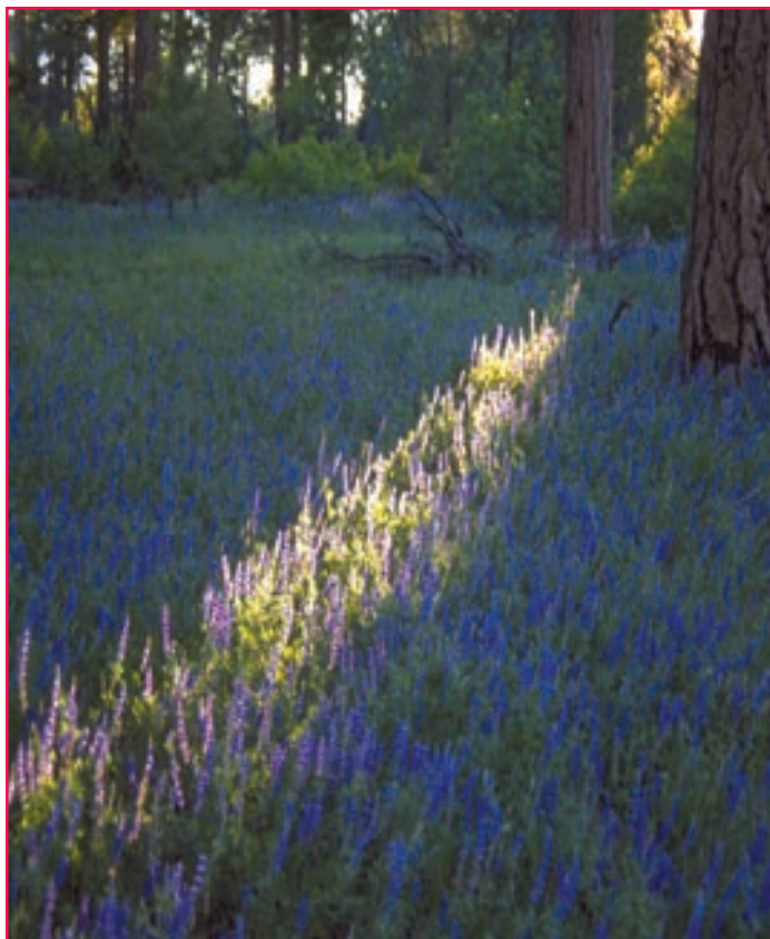
First Place, Miscellaneous. Lupines carpeting the floor of an open old-growth ponderosa pine forest maintained by frequent lightning fires on the Powell Plateau, North Rim, Grand Canyon National Park, AZ.

Do you have a photo that tells a story about wildland fire management? Would you like the thrill of seeing your photo in print? If so, turn to page XX for instructions on how to enter our 2001 photo contest. ■