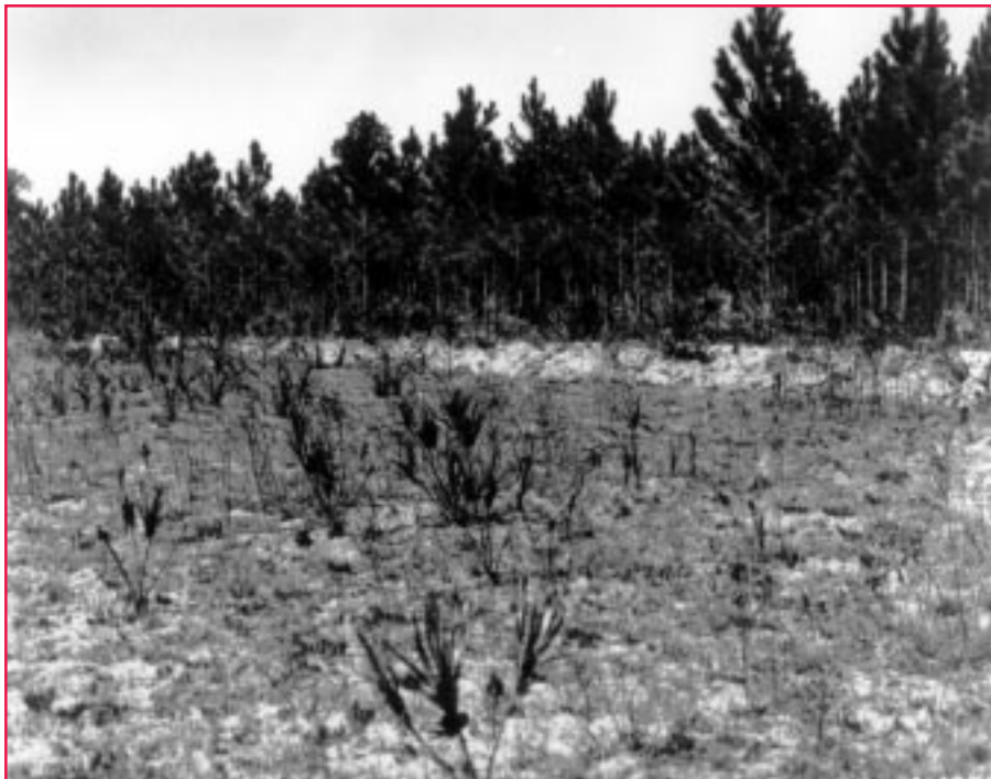
Results of experimental burning in the 1930's. The entire area was planted with seeds from slash pine ( Pinus elliottii) in 1930. The plot in the foreground was burned every year, whereas the plot in the background was protected from fire. The results in 1939 seem to show that burning is bad for pine regeneration. Until the 1960's, the Forest Service drew on such experiments to justify its policy of systematic fire control.