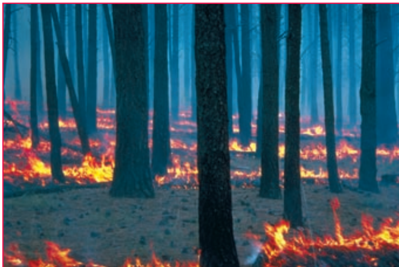
Honorable Mention, Prescribed Fire. Strip firing under ponderosa pines on the Fort Valley Experimental Forest, Coconino National Forest, AZ.