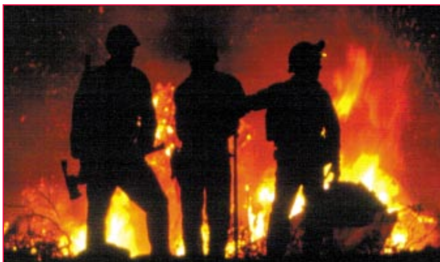
Sawtooth Hotshots conducting a night burnout on the Rabbit Creek Fire, part of the 1994 Idaho City Complex. Since 1910, a powerful narrative of firefighter heroism has helped to popularize wildland fire suppression.

The difference between fire suppression and fire use is that firefighting can tell a marvelous story, whereas prescribed burning cannot.