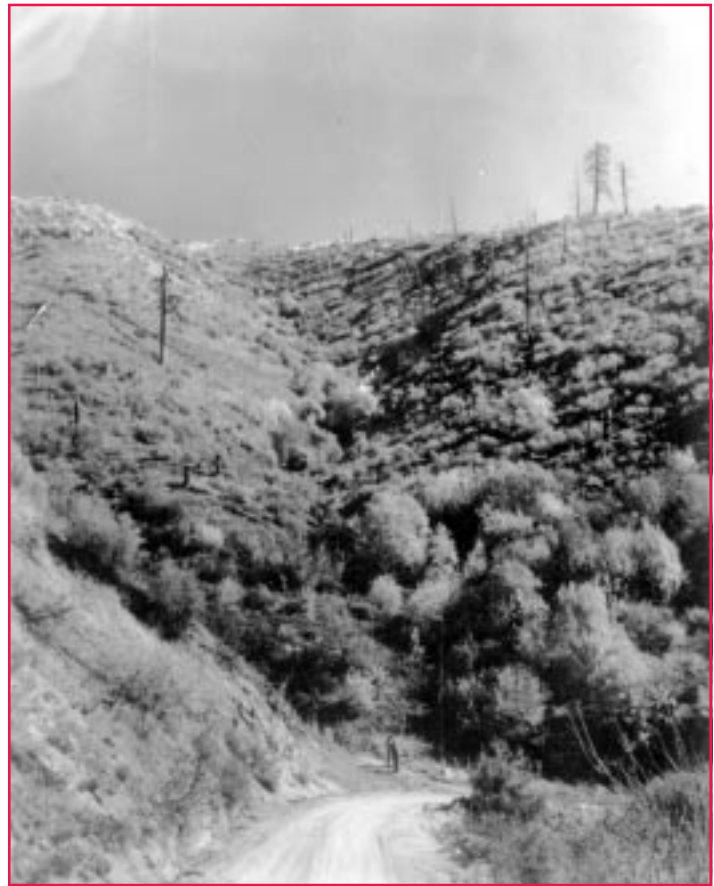
Conversion of ponderosa pine forest to brushfields. The 1931 Quartzburg Fire on Idaho's Boise National Forest was so intense that it killed the pines in the draw near Grimes Creek (left). By 1950, in the absence of pine regeneration, brush covered the site (right). Until the 1960's, the Forest Service used such before-and-after photos to justify a policy of systematic fire exclusion. Ironically, fire exclusion exacerbated the problem by allowing fuels to build up, feeding abnormally intense fires that could eliminate forest cover for generations.