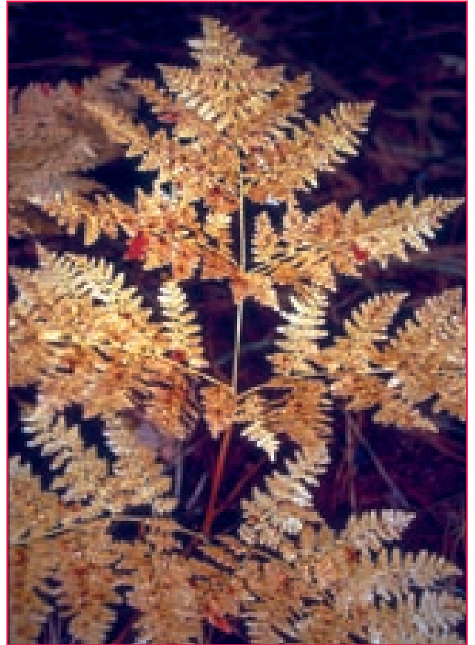
Second Place, Miscellaneous. Bracken fern, one of many carpeting the forest floor 2 years after a prescribed fire on the Coconino National Forest, AZ.