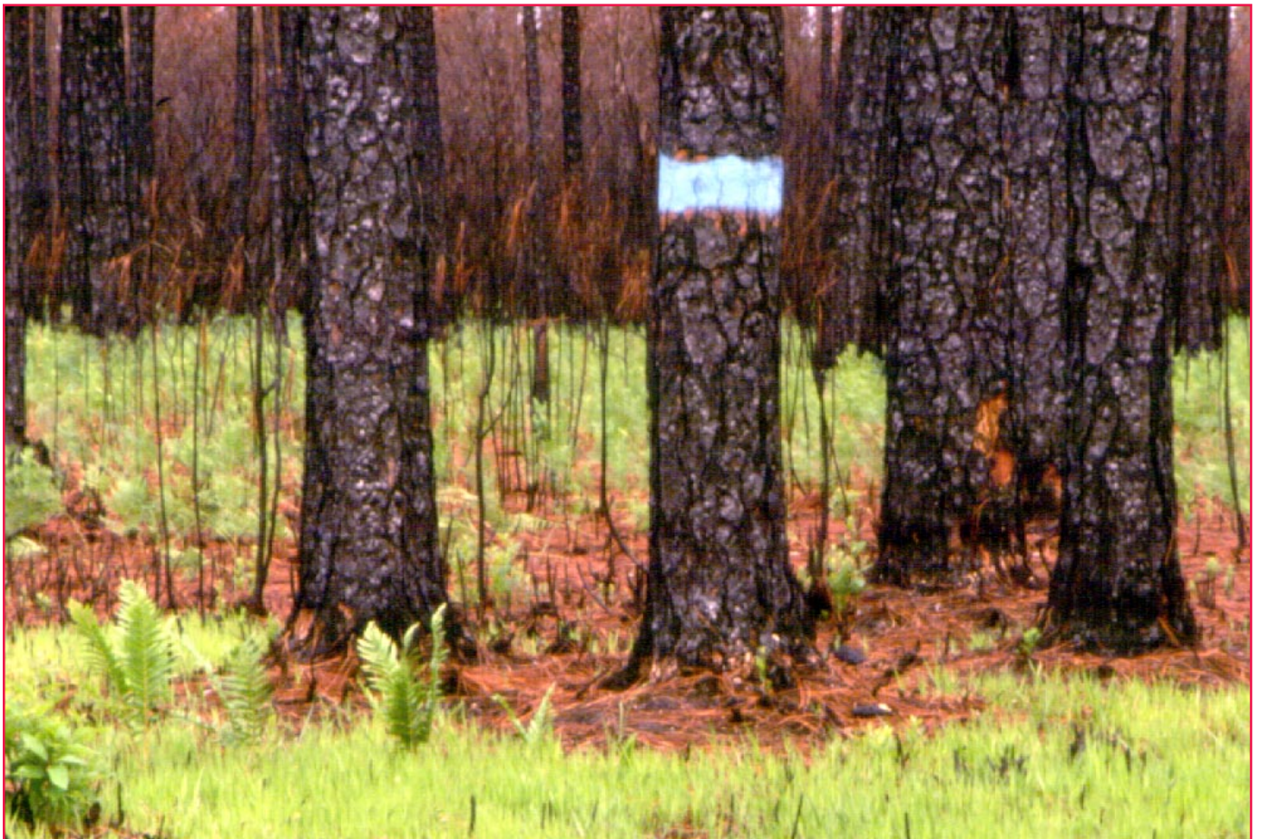
Greenup after a surface fire passed through a red-cockaded woodpecker colony in longleaf pine on North Carolina's Croatan National Forest. Regular burning in longleaf pine, a fire-adapted forest type, trims the hardwood scrub, dampens the severity of future fires, and jolts the biota to renewed vigor.

Perhaps we have it backward. To argue that we need fire solely to reduce fuel shrivels fire to the status of a flaming ax, and it simplifies fuels to the status of carbon bullion, inert as sawn lumber. Burning becomes a choice, not an ecological necessity. The fuel crisis invites us to pick up, as it were, the other end of the firestick. It suggests that, instead of regarding controlled fire primarily as a means to manage fuels, perhaps we should think of fuels as a means to manage the burning a biota needs, to imagine fire as a threatened species and devise a suitable habitat for it. If that ecological imperative isn't there, then probably prescribed fire shouldn't be, either. ■