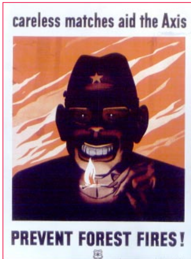
Wartime poster against careless fire use, 1942–45. Before Smokey Bear, the Forest Service used various images to promote wildland fire prevention, including some that today would be rejected as ethnically offensive. Illustration: USDA Forest Service, Washington, DC.