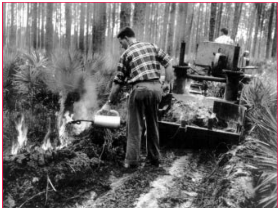
Prescribed burning in a longleaf pine ( Pinus palustris) forest in Florida, 1954. Despite the triumph of fire exclusion over light burning, prescribed fires continued on the Coastal Plain in the South to reduce hazardous fuels and eliminate competing hardwoods from open pine forests.