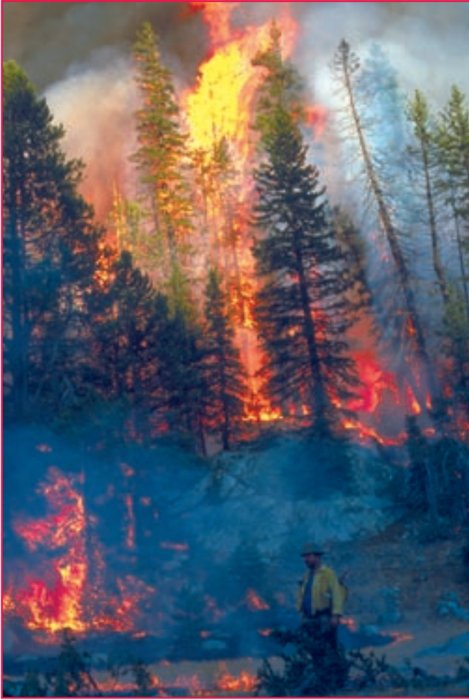
First Place, Ground Resources. Firefighter burning out a section of fireline on the 1988 Fayette Lake Fire, Jim Bridger Wilderness, Bridger-Teton National Forest, WY.