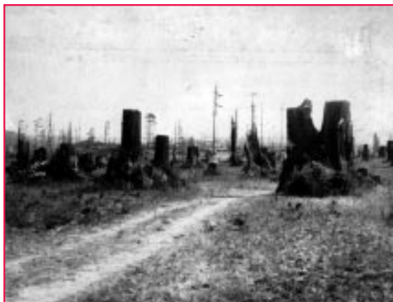
Old redwood (Sequoia sempervirens) forest in California, converted to pasture through logging and repeated burning, 1903. "Cut-and-run" logging, often followed by heavy slash fires, devastated America's forests and galvanized public support for a National Forest System to protect remaining wildlands.

In the 1890's, when the first forest reserves were established, the early conservation movement (including scientific forestry) was in its heyday. Foresters such as Gifford Pinchot, first Chief of the USDA Forest Service, shared the view that fire was the bane of the forests. Wildland fires, they believed, had to be eliminated in order for the forests to grow and thrive. Fires not only destroyed the standing trees, but also burned the fragile seedlings and young trees springing forth for the next forest generation. Fire was the mortal and mortal enemy of the forests (Saveland 1995; Schiff 1962).