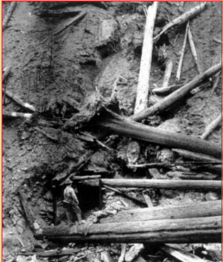
The eye of the 1910 firestorm, Pulaski's tunnel, now listed in the National Register of Historic Places.

Eventually, the Big Blowup burned over the whole of the 20th century.