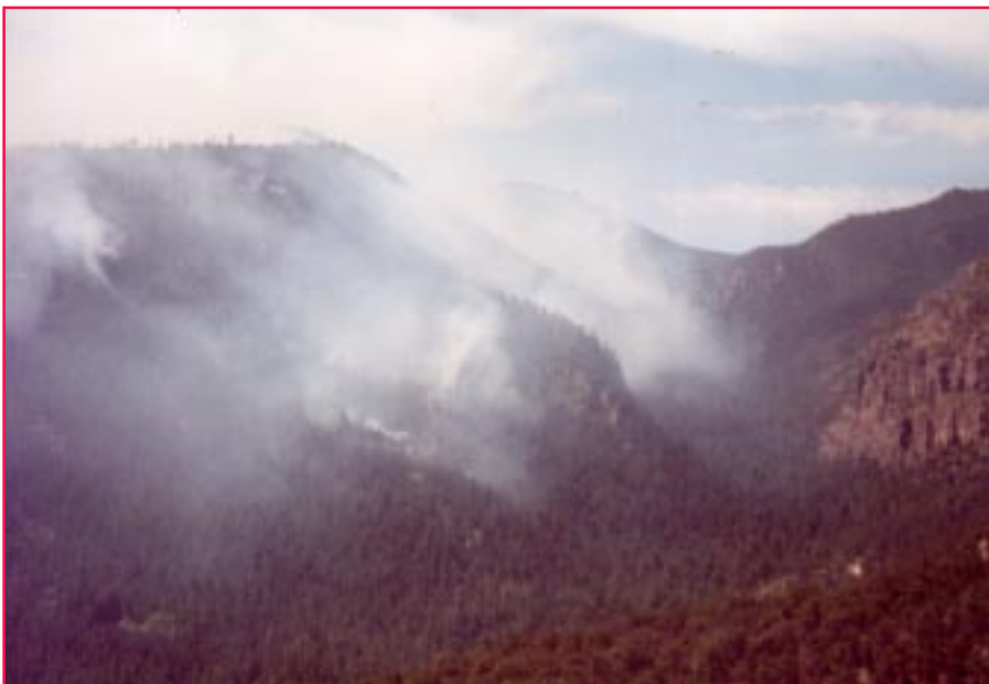
Cerro Grande Fire burning in Santa Clara Canyon near Los Alamos, NM. Steep, densely forested terrain complicated control strategies for wildland firefighters.