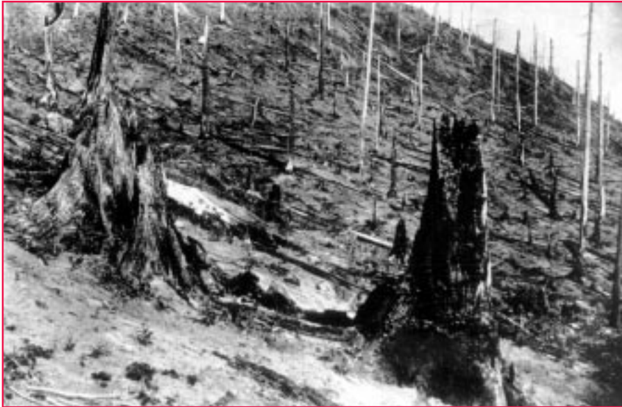
Burned and reburned area of coniferous forest in Washington, 1892. Such scenes appalled early American conservationists and inspired the leaders of the USDA Forest Service to pursue systematic fire exclusion.