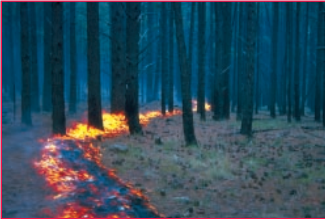
First Place, Prescribed Fire. Single strip of prescribed fire under ponderosa pines on the Fort Valley Experimental Forest, Coconino National Forest, AZ. Photo: Allen Farnsworth, USDA Forest Service, Coconino National Forest, Peaks Ranger District, Flagstaff, AZ, 1996.

Finally, we made the awards, based partly on absolute merit. For example, if we decided that there was only one excellent photo in a category, then we made only one award in that category—First, Second, or Third Place, depending on how outstanding we thought the photo was.