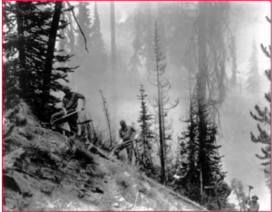
A crew from the Civilian Conservation Corps (CCC) digging a fireline on the 1937 Deadwood Creek Fire, Challis National Forest, ID. Fire crews from the CCC finally gave the Forest Service the ability to control most wildland fires.

Today, wildland firefighting is almost a full-time occupation. Firefighting on the Nation's