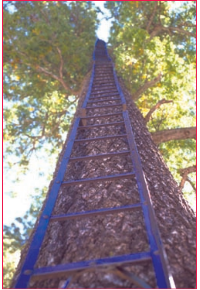
Third Place, Miscellaneous. Historic fire lookout tree on Lindberg Hill, North Rim, Grand Canyon National Park, AZ.