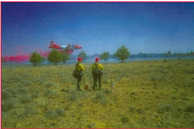
First Place, Aerial Resources. A P3-A airtanker delivering retardant on the 1999 Yellow Pine Complex, Modoc National Forest, CA. Redding Hotshots (foreground) are preparing to help burn out a large section of fireline after the retardant drop.