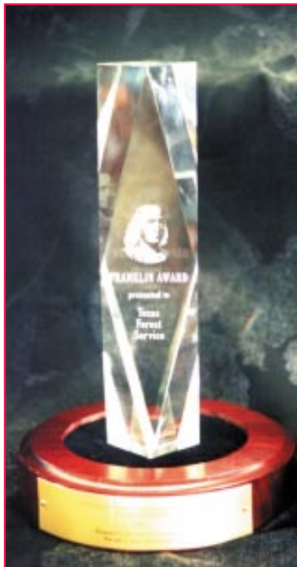
Franklin Award trophy for outstanding achievements in fire protection outreach to underserved communities.

The Forest Service's VFA program is designed to help smaller communities improve (or begin) fire protection. The Franklin Award for VFA goes to the State that demonstrates the best outreach to help underserved communities improve the fire protection they offer their people.