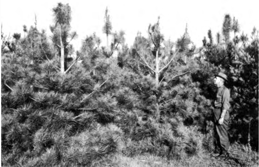
Figure 3.—Badly damaged red pine stand showing spiked and bushy tops. F-498467

When the terminal and lateral buds on a leader are killed by the shoot moth, a dead spike top (fig. 3) may result. Fascicle buds often develop from the shoot below this point, forming a dense growth or bush (fig. 3) the following season. Sometimes when the terminal bud is killed, several lateral buds develop into competing leaders, resulting in a forked stem (fig. 4). When a new shoot is weakened to the point where it falls over yet continues to grow, a severe crook (fig. 5) develops. Larval feeding on only one side