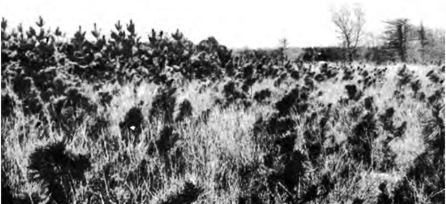
Figure 7. — Bottom whorls of branches being removed in a young red pine planting for shoot moth control.