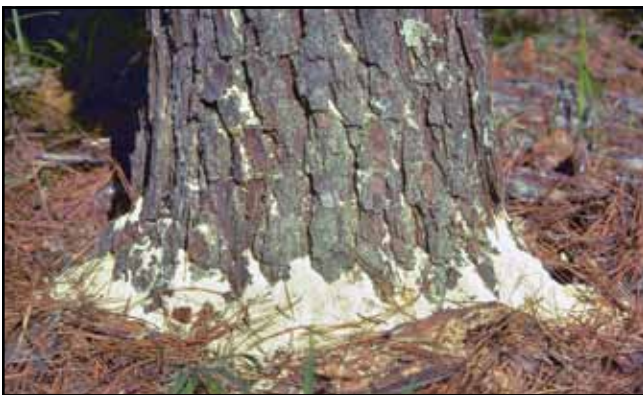
Figure 8. Boring dust of ambrosia beetles around the base of a tree vacated by southern pine beetles.