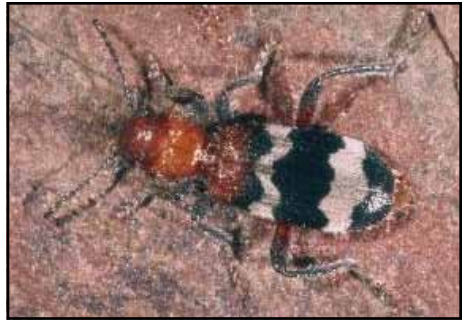
Figure 7. Adult of Thanasimus dubius , a clerid beetle and predator of the southern pine beetle.

Most multiple-tree infestations are initiated in the spring. Overwintering beetles emerge and disperse in search of suitable host trees. Lightning-struck