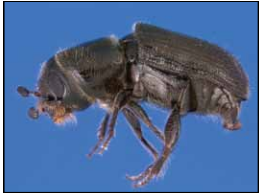
Figure 2. Adult southern pine beetle.

The female initiates the attack. Once a suitable host is located, the female releases aggregation pheromones, primarily frontalin. Frontalin, in combination with host odors, attracts a male for mating plus additional males and females. Arriving males also release pheromones, including endo -brevicomin, which may increase aggregation. If sufficient numbers of beetles are attracted, host resistance is overcome and the tree is successfully colonized. Verbenone is a pheromone produced essentially by males, and at high concentrations it can inhibit landing and cause beetles to switch attacks to adjacent pines.