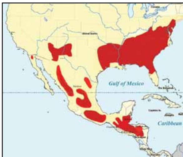
Figure 1. Range map for southern pine beetle; Mexico distribution adapted from Salinas-Moreno et al. 2004.

outbreak levels, and healthy, vigorous pines may be attacked and killed as infestations expand. The southern pine beetle generally is in outbreak status every year somewhere within its range. Average annual tree mortality in the U.S. often exceeds 100 million board feet of sawtimber and 30 million cubic feet of pulpwood. From 1999-2002, an outbreak in the eastern U.S. caused in excess of one billion dollars in timber losses. Over 225,000 acres of pine forests in Central America were killed over that same period.