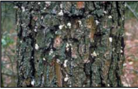
Figure 4 A (above) and B (left). Southern pine beetle pitch tubes.

ly with frass. The beetles occasionally bore ventilation or reemergence holes leading straight out from the gallery to the bark surface. Newly-hatched larvae mine away from the gallery in the inner bark. Later-stage larvae move into the outer bark to feed and pupate. New adults chew small, round exit holes, creating a shotgun pattern on the bark surface after mass emergence (Fig. 6). Both brood adults and reemerged parent adults can fly and attack new trees. Beetles also inoculate pines with blue stain fungi which penetrate the sapwood. The girdling of the host