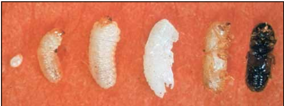
Figure 3. Left-right: Southern pine beetle egg, early instar larva, late instar larva, pupa, callow adult, mature adult.

Once beneath the bark, females begin constructing S-shaped egg galleries in the cambium (Fig. 5). Eggs are laid in niches cut in the wall of the gallery. The male follows behind the female, packing the galleries behind them tight-