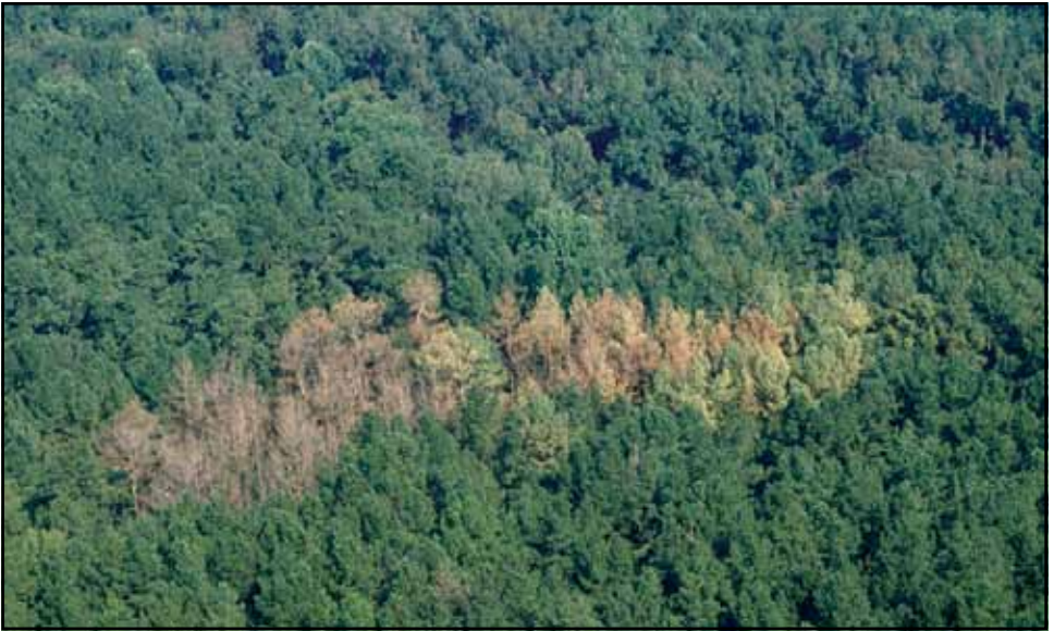
Figure 9. Infestation “spot” head with fading trees.

sal is limited, and most beetles are located within expanding spots. As temperatures cool in the fall, beetles may remain in spots or disperse to individual trees for the winter. Beetles may overwinter in all stages within a tree. Development slows during the winter, but there is no diapause. During warm winter periods, development continues and some emergence may occur. Winter-emerging adults may colonize unoccupied portions of the same trees from which they emerged. A few infestations may remain active throughout the winter when temperatures are favorable.