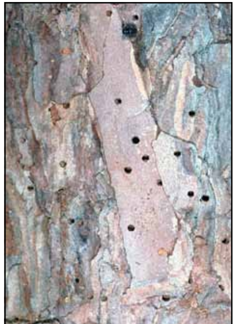
Figure 6. Southern pine beetle brood adult exit holes.