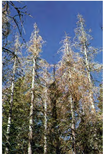
Figure 2.—A stand of white fir in north-eastern California heavily damaged by defoliation from the Douglas-fir tussock moth. F-701857

The tussock moth has three preferred hosts, and its preference appears to depend on locality. In the northern part of its range (British Columbia and northern Washington) Douglas-fir is preferred; in the central area (southern Washington, Oregon, and Idaho), Douglas-fir, white fir, and grand fir are all equally acceptable. In the south (California, Nevada, Arizona, and