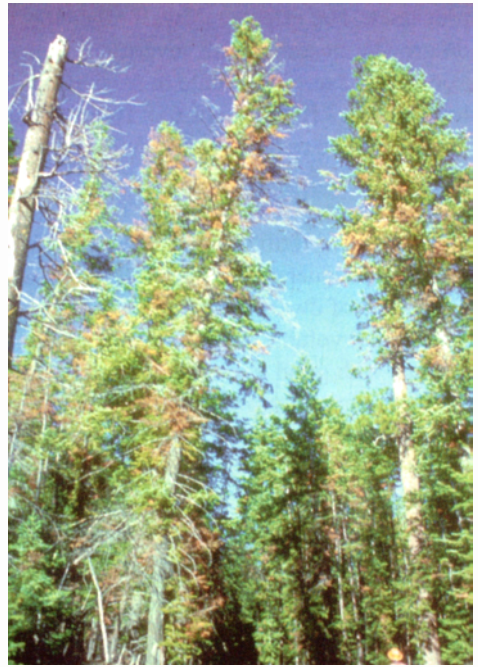
Fig. 4. Branch mortality and flags associated with fir dwarf mistletoe and cytospora canker in severely infected grand fir.

In mixed-species stands that contain fir infected by dwarf mistletoe, silvicultural treatments should favor other tree species. Non-hosts left between infected and non-