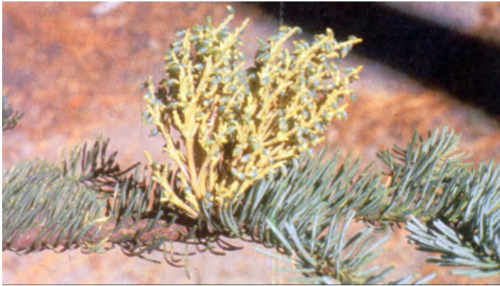
Fig. 3. Female shoots of fir dwarf mistletoe.

Fir live crown ratio has an important effect on the consequences of fir dwarf mistletoe. The effect of dwarf mistletoe on radial, height, and volume growth rates is greatest in trees with good live crown ratios (> 80%), the fastest growing, and become almost negligible in trees with live crown ratios < 40%, the slowest growing. On the other hand, trees with good live crown