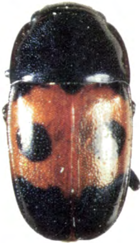
Figure 7. —Sap-feeding beetle. F-703172

trees to wounds on healthy oaks, the disease-causing spores are transmitted to a new host.