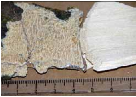
Figure 3. Two fungi that frequently cause stem decay in aspen, but account for less decay volume than Phellinus tremulae . Top: Peniophora polygonia fruiting at the edge of a wound on a live aspen. The callus wood beneath the fruiting was dead and slightly decayed with a white rot. Bottom: Radulodon americanus herbarium specimen and associated firm white rot. Ruler is marked in centimeters.

than that of Phellinus tremulae , although the latter causes much more decay. Radulodon americanus is seldom found in western North America. Inocutis rheades probably occurs throughout the range of aspen but is generally uncommon.