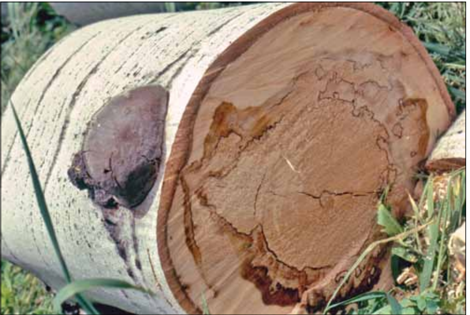
Figure 2. Phellinus tremulae fruit bodies and decay on live aspen stems. Top left: column of decay in stem leaving little sound wood. Top right: perennial conks often form at branch stubs. Bottom: decayed wood in center is surrounded by brown stained wood.