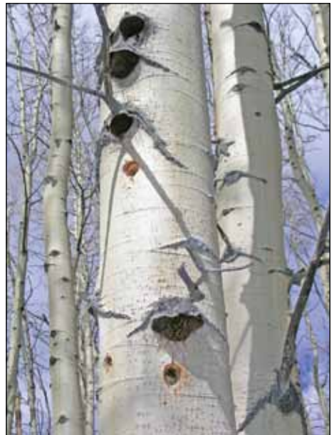
Figure 5. Three cavity nest entrances associated with conks of Phellinus tremulae on a live aspen stem.

cavity nesters, which use nests excavated by other species, also take advantage of the habitat provided by the stem-decay fungi (Figure 5). Many mammals also take advantage of decay columns for protection, both before and after the tree falls. In the Rocky Mountains and many other predominantly coniferous forest regions, the great majority of cavity nests are excavated in aspen, even when aspen is a minor forest component, and in some reports all such nests were associated with Phellinus tremulae . Such decay in live trees combines the benefit of easy excavation with a barrier of sound wood protecting the nest from predators. Often, live aspen stems are strongly preferred, but in some areas, snags are preferentially used. It is not clear if preference for snags, where it occurs, is associated with either lack of stem decay in live trees or low predation pressure.