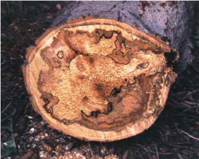
Figure 6. Advanced white trunk rot in aspen surrounded by discoloration. Note that decay has invaded sapwood and even the cambium is being killed in some areas.

Because of thin bark, relatively minor wounds on aspen permit the entrance of various organisms into the wood beneath. There is no practical way to exclude these organisms by reducing injuries; nor is there any practical