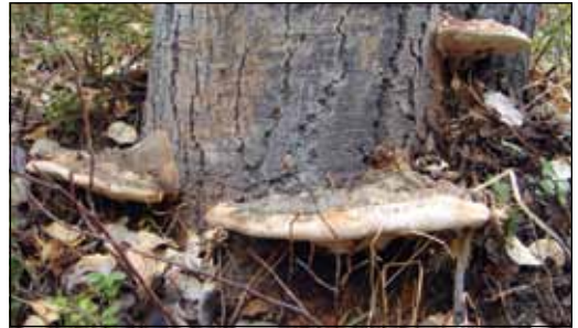
Figure 4. Butt rot in aspen. Top left: Flammulina populicola fruiting in the hollow butt of a live aspen. Top right: root failure associated with decay caused by Ganoderma applanatum . Note the conk on the lower stem (yellow arrow); the orientation of the conk indicates that it formed while the tree was standing. Bottom: conks of G. applanatum at base of standing trees.

cavity nesters, which use nests excavated by other species, also take advantage of the habitat provided by the stem-decay fungi (Figure 5). Many mammals also take advantage of decay columns for protection, both before and after the tree falls. In the Rocky Mountains and many other predominantly coniferous forest regions, the great majority of cavity nests are excavated in aspen, even when aspen is a minor forest component, and in some reports all such nests were associated with Phellinus tremulae . Such decay in live trees combines the benefit of easy excavation with a barrier of sound wood protecting the nest from predators. Often, live aspen stems are strongly preferred, but in some areas, snags are preferentially used. It is not clear if preference for snags, where it occurs, is associated with either lack of stem decay in live trees or low predation pressure.