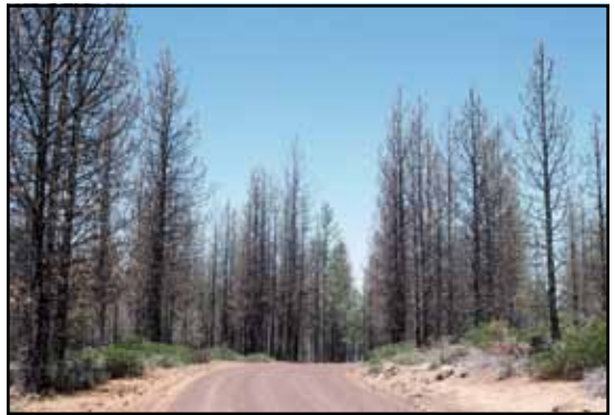
Figure 2 – Heavy defoliation of ponderosa pine by pandora moth in central Oregon

have shiny black heads and brown to black bodies covered with short black hairs (Figure 5) When mature, larvae are 5.7 to 7.6 cm (2 ¼ - 3 inches) long, vary in body color from brown or black to dark green with white lines or bands along the sides of each body segment. The ends of each body segment are light red-brown. Head capsules are dark red-brown. Color pattern of mature larvae resembles that of a pine branch (Figure 6).