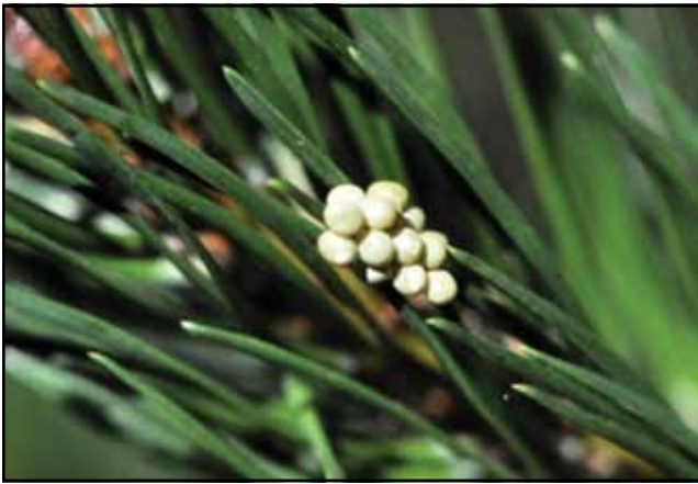
Figure 4 – Pandora moth egg cluster on pine needles

adults may be present during the year when most of the population is in the larval stage.