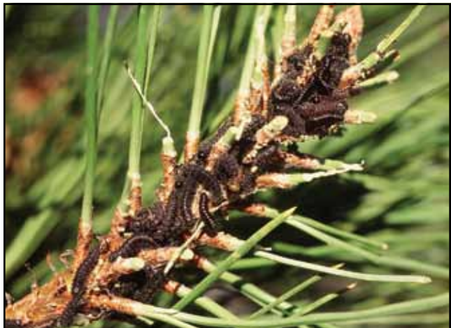
Figure 5 – Colony of young pandora moth larvae

The pandora moth's two-year life cycle, with heavy defoliation every other year during outbreaks, allows for some tree recovery. However, growth loss and some tree mortality have been associated with outbreaks. For example, during an outbreak on the North Kaibab Plateau of northern Arizona, defoliation reduced growth by 10-15% on trees 14 inches dbh and larger, but tree mortality was