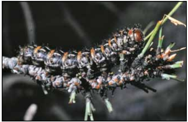
Figure 6 – Mature larva of pandora moth

Mature larvae are a traditional food for the people of the Paiute Tribe of the Owens Valley/Mono Lake areas of California. Every other year, during the second or third week of June, they search for evidence of larvae around the bases of large Jeffery pines. Trees with larvae are located by the presence of frass on the forest floor. The people return to these trees in early July to collect mature larvae as they migrate from the tree crowns to pupation sites in the soil. Collection and preparation of pandora moth larvae is a traditional family activity that can last for two to three weeks. Mature larvae are collected in trenches dug around the drip line of large infested pines. The Klamath and Modoc tribes collect and roast the pupae, which are also considered a delicacy.