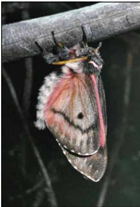
Figure 3 – Adult female pandora moth at rest on pine branch

Larvae are about 5 mm (less than ¼ inch) long when first hatched. They