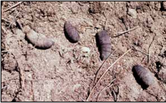
Figure 7 – Pandora moth pupae in soil

pupate at a depth of 10-15 cm and overwinter.