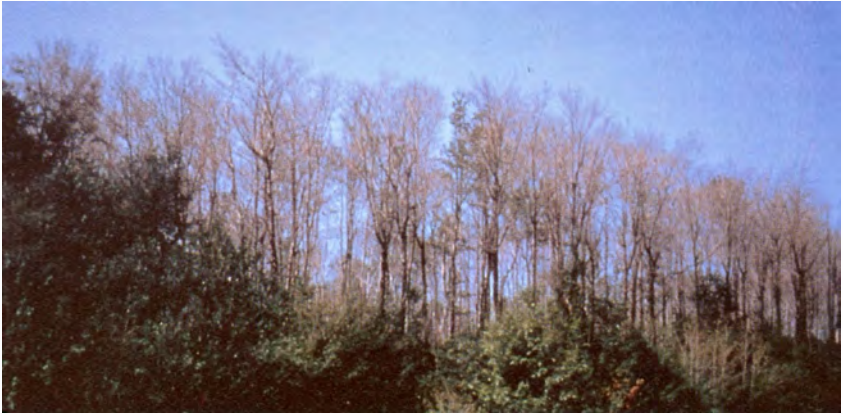
Figure 7 —Severe defoliation in a stand of maple caused by the saddled prominent.

Conventional chemical controls include insecticides containing carbaryl or acephate. Both are registered for use against this defoliator. An alternative to conventional chemicals is a biological insecticide containing the bacterium Bacillus thuringiensis . When applied correctly, this bacterium is effective against many lepidopterous defoliators and has no direct effect on the parasite/predator complex.