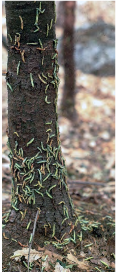
Figure 5—Larvae migrating to a new food source—the typical response when they have stripped a tree.

The saddled prominent can also affect forest recreation and maple syrup production. Severe defoliation, wandering larvae, and falling frass (caterpillar droppings) may significantly reduce the quality of recreational experiences. Sugar maples defoliated by the saddled prominent produce less sap when tapped for maple syrup production.