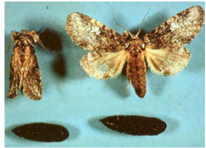
Figure 3 —The pupal and adult stages of the saddled prominent. The cocoons around the pupae have been removed.

The adults are inconspicuous moths. They vary from greenish gray or brownish gray to olive with creamy white and black splotches. Generally, the male moths are darker and have less pronounced markings. The bodies of both male and female moths are about 19 millimeters long. The female, however,