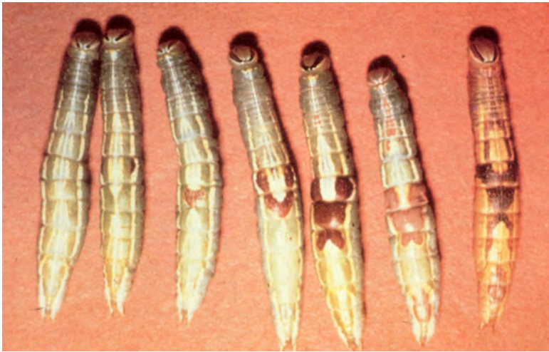
Figure 2 —Larvae with different colors and markings. The variations are typical of the saddled prominent.

The head is dark pink. The third and fourth instars vary in color, but greens and browns predominate. The prothoracic horns are further reduced, and the abdominal spikes disappear completely. In addition, each side of the head is marked with a multicolored stripe. The fifth—and final—instar is approximately 28 millimeters long. It is usually green and has a red saddlelike mark on its back. By this stage, the prothoracic horns have disappeared. (See cover photo and fig. 2.)