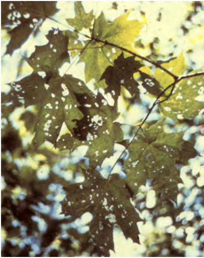
Figure 4 — Translucent patches, which look like holes, on sugar maple leaves skeletonized by the saddled prominent.

The adults begin to emerge from the leaf litter in late May. Emergence peaks in mid-June and ends about the first week of July. Male moths generally emerge 2 to 3 days before the females. The moths normally emerge during the daylight hours and crawl to a nearby tree or other vertical surface. Once there, they ascend about 3 feet (1 m), inflate their wings to dry them, and then rest for the remainder of the day. Because they are mottled, moths can rest inconspicuously on the bark.