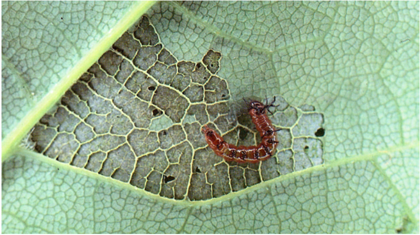
Figure 1 —A first instar with its horns and abdominal spikes. The interveinal feeding of the young larvae skeletonizes the undersides of the leaves.

New York, Pennsylvania, and Vermont. Maine recorded further outbreaks in 1976–78 and in 1981—outbreaks during which the saddled prominent defoliated more than 500,000 acres (202,500 ha).