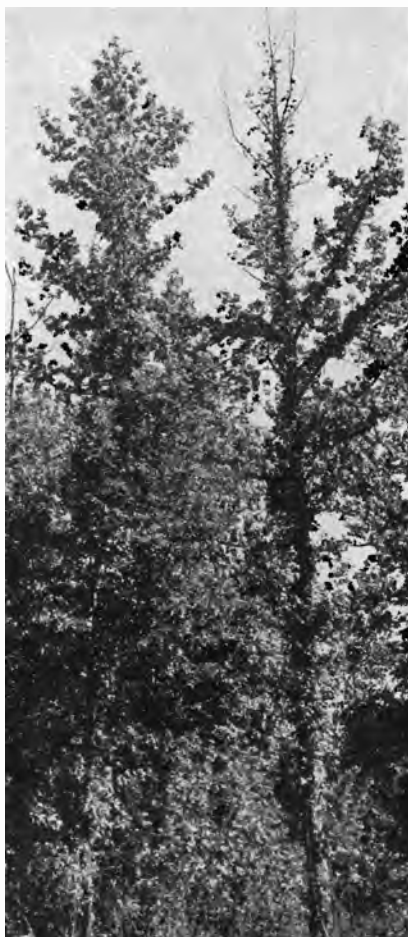
F-486347 Figure 2. —Sweetgum in a 30-year-old stand. Compare the sparse, dwarfed upper crown of the diseased tree on the right with that of the adjacent healthy tree.

Sweetgum should not be favored for sawtimber on heavy, slack-water, bottom-land soils and on most rolling upland soils (except on the Loessial