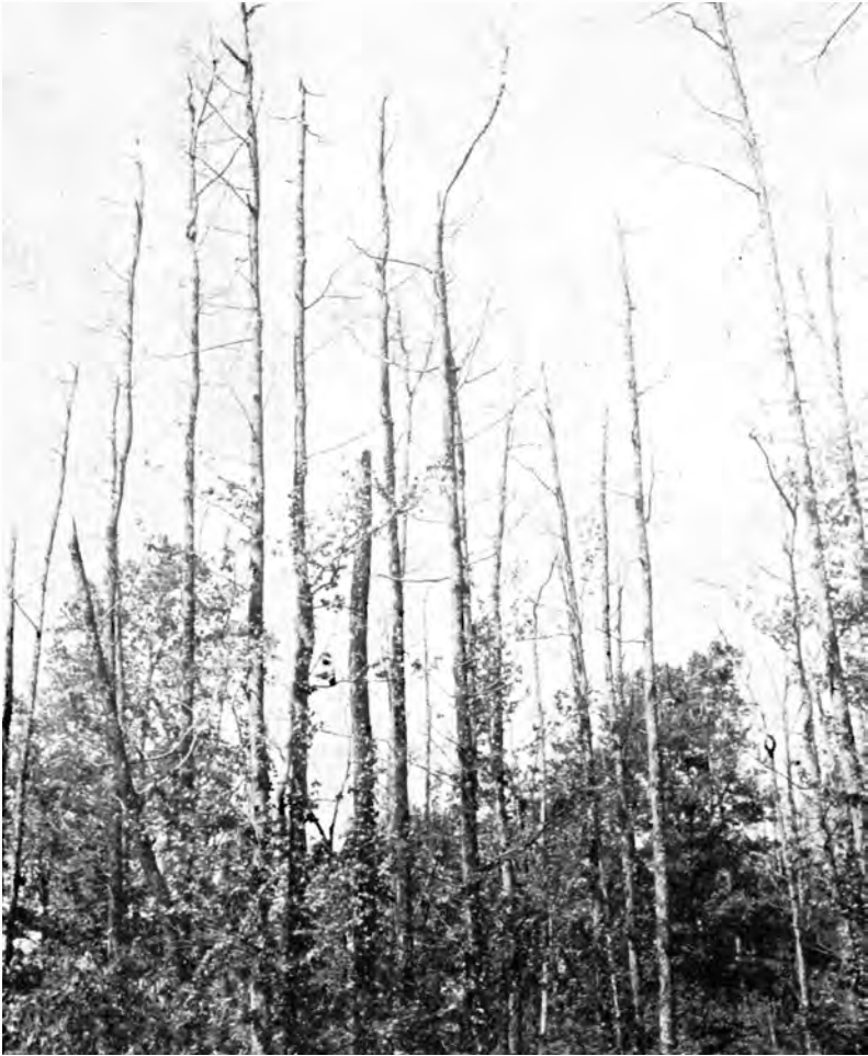
Figure 1.—A badly diseased sweetgum stand.