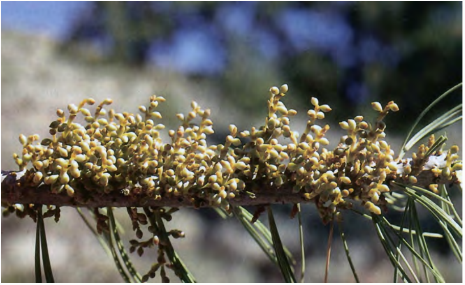
Figure 2. Female shoots of limber pine dwarf mistletoe.

tissues are alive. The mistletoe is dependent upon its host for water and nutrients. The aerial shoots do contain chlorophyll, but they produce minor amounts of carbohydrates.