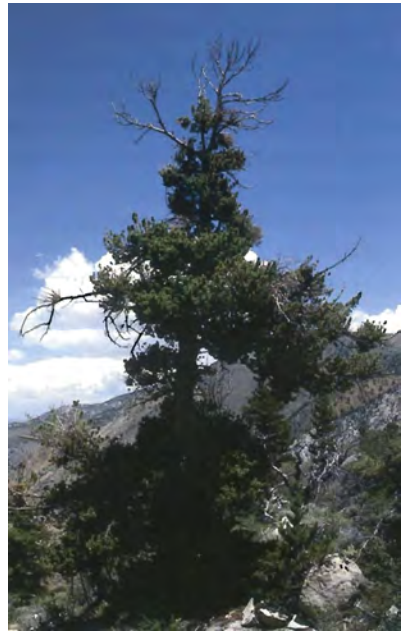
Figure 3. Witches' brooms on a severely infected limber pine.

Nearly all spread is local and results from explosive discharge of seeds. Wind exerts a minor influence on distance and direction of seed travel. Birds and other animals are responsible for some long-distance spread when seeds stick to their bodies and later are rubbed off onto susceptible trees. Widely scattered populations of limber pine dwarf mistletoe, such as those in the Great Basin, southern California, and Oregon, probably represent situations where this