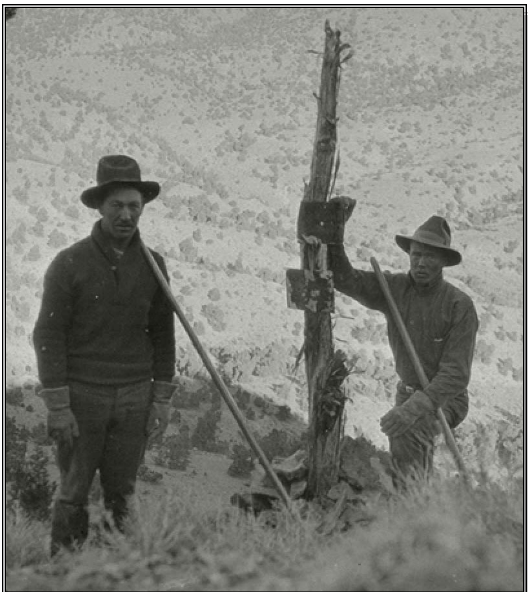
Posting the Toiyabe National Forest Boundary, 1924