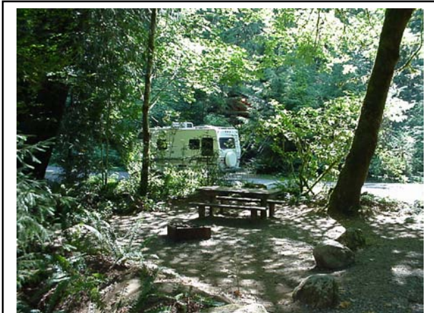
Falls Creek Campground is located in the Olympic temperate rain forest on the south shore of Quinault Lake.

SETTING: Falls Creek Campground is located on the south shore of Quinault Lake next to Falls Creek, a crystal clear stream, in the temperate rain forest. A beautiful stand of conifers provides a dense overstory. A lush emerald understory of rain forest plants provides a very scenic setting for a relaxing camp. The forested slopes of the Olympic National Park provide a scenic backdrop across Quinault Lake.