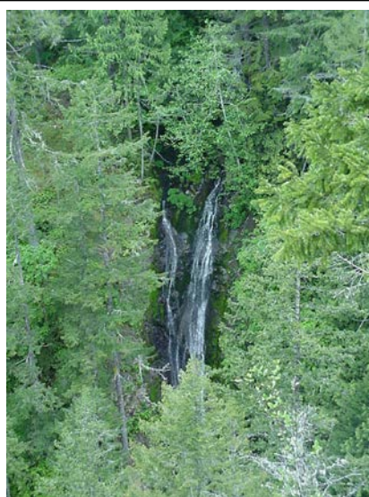
Falls View waterfall

This waterfall is located off of U.S. Highway 101 at Falls View Campground located 4 miles south of Quilcene and 9 miles north of Brinnon. This short trail begins in the south loop of the campground. The 80-120 foot waterfall pours into the Big Quilcene River and is also known as the Campground Falls.