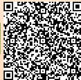
BNF Wild Pig Reporting Form