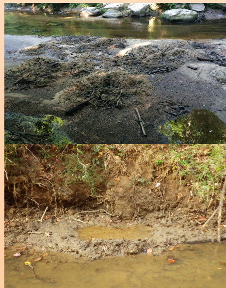
Destructive rooting and wallowing within the Sipsey Wilderness Area