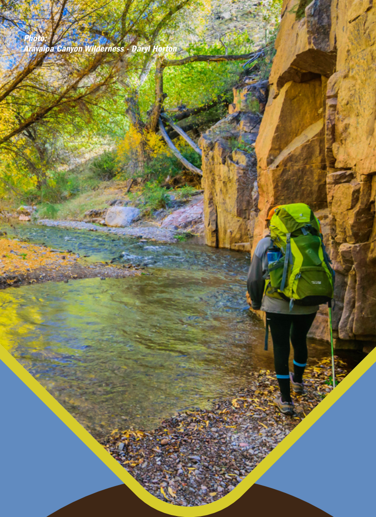
Photo: Aravaipa Canyon Wilderness