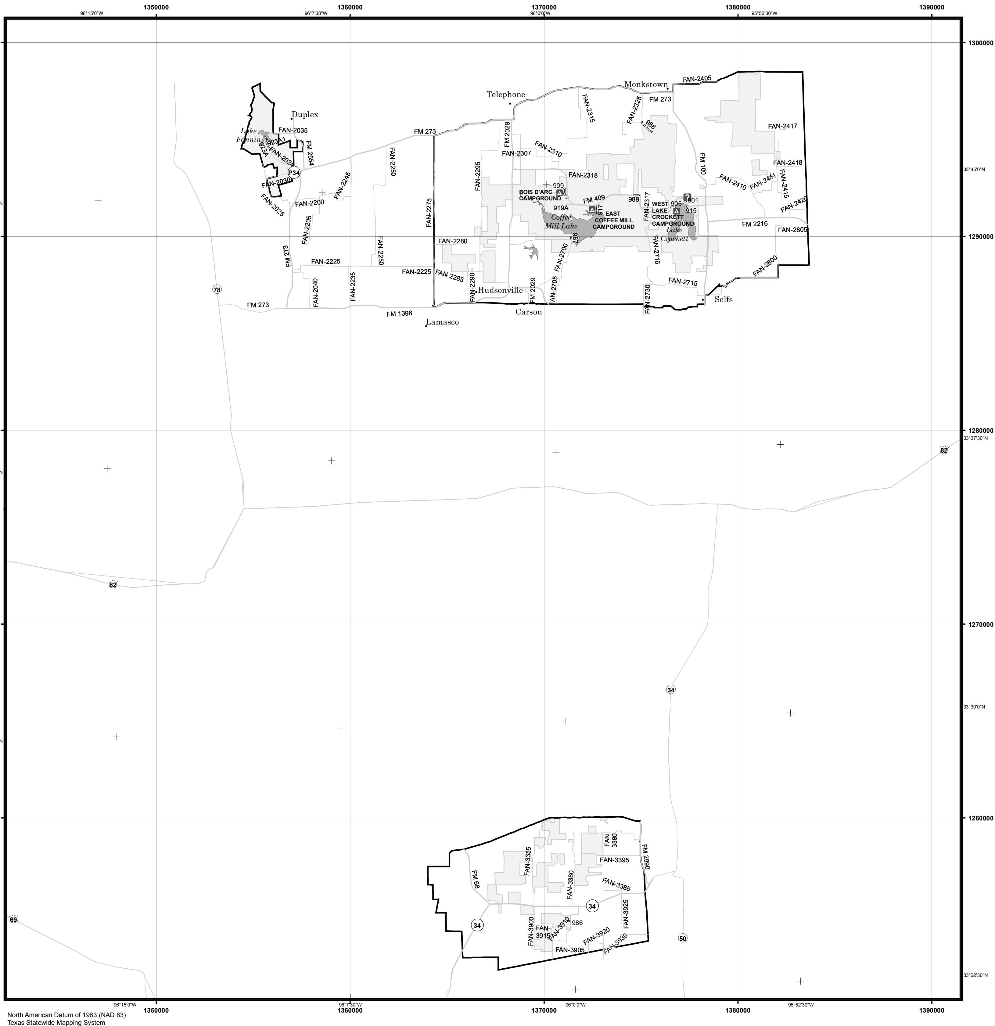
North American Datum of 1983 (NAD 83) Texas Statewide Mapping System