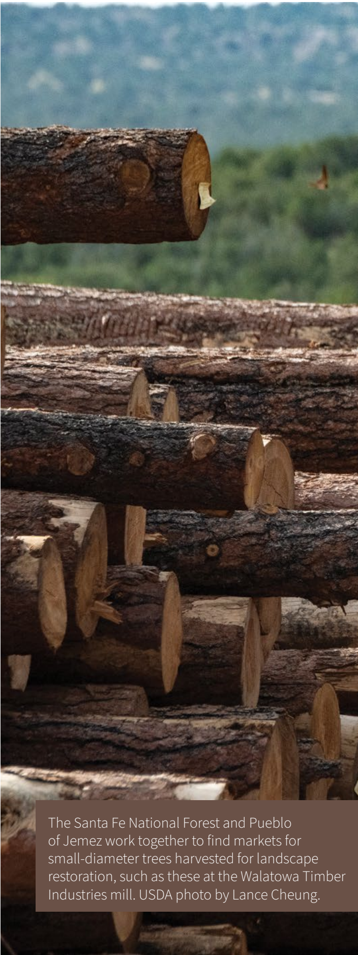
The Santa Fe National Forest and Pueblo of Jemez work together to find markets for small-diameter trees harvested for landscape restoration, such as these at the Walatowa Timber Industries mill.

The Forest Service is accountable in numerous ways to demonstrate success in Tribal relations, including actions and reporting that are responsive to the USDA