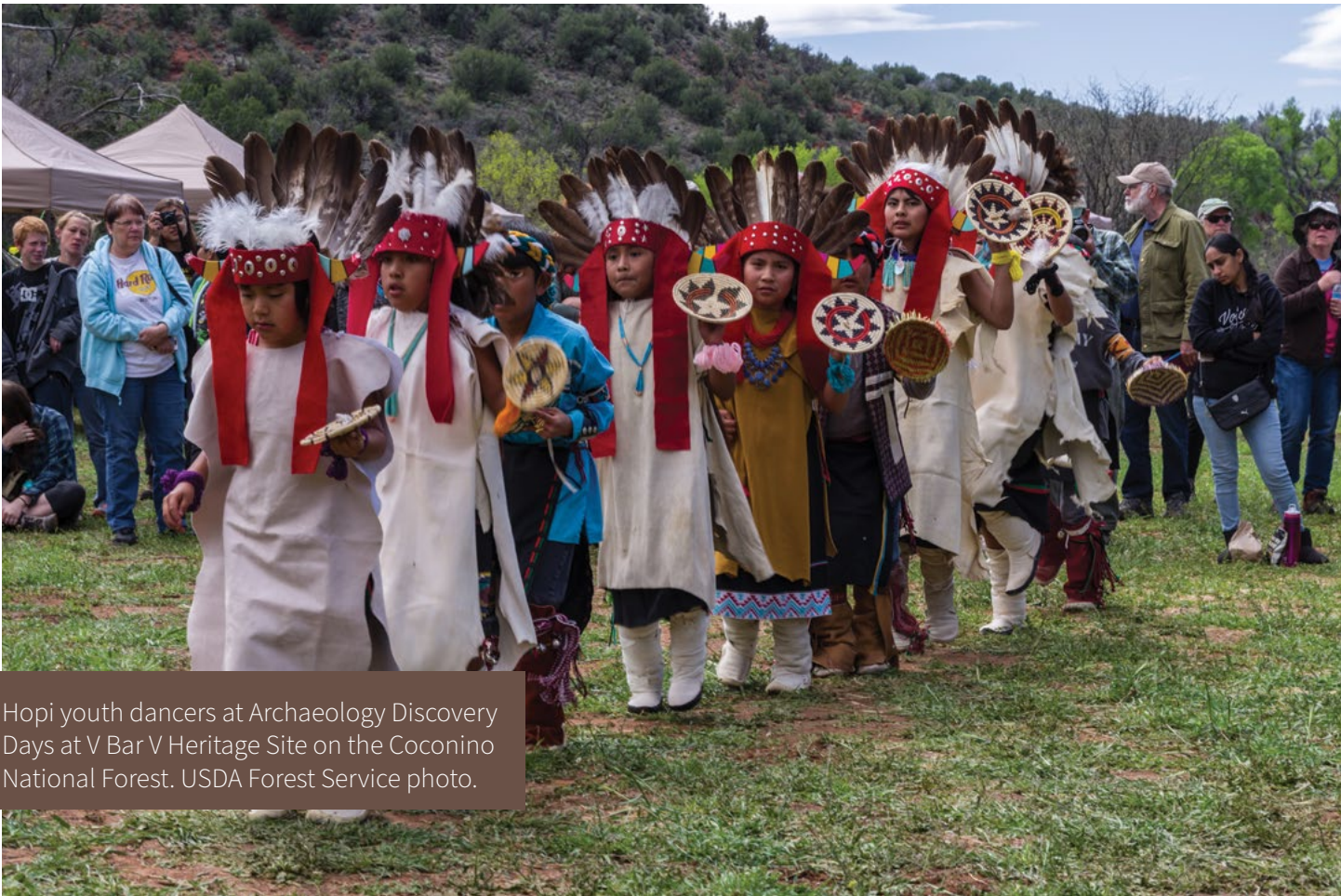
Table 2d.—Steward Natural and Cultural Resources