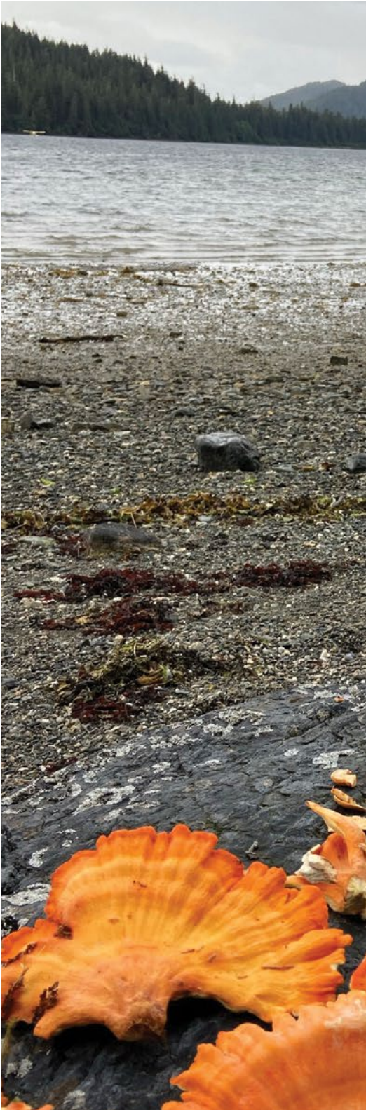
Chicken of the woods, an edible shelf fungus, ethically harvested in Kootznoowoo Wilderness, Admiralty Island National Monument, Tongass National Forest, AK.