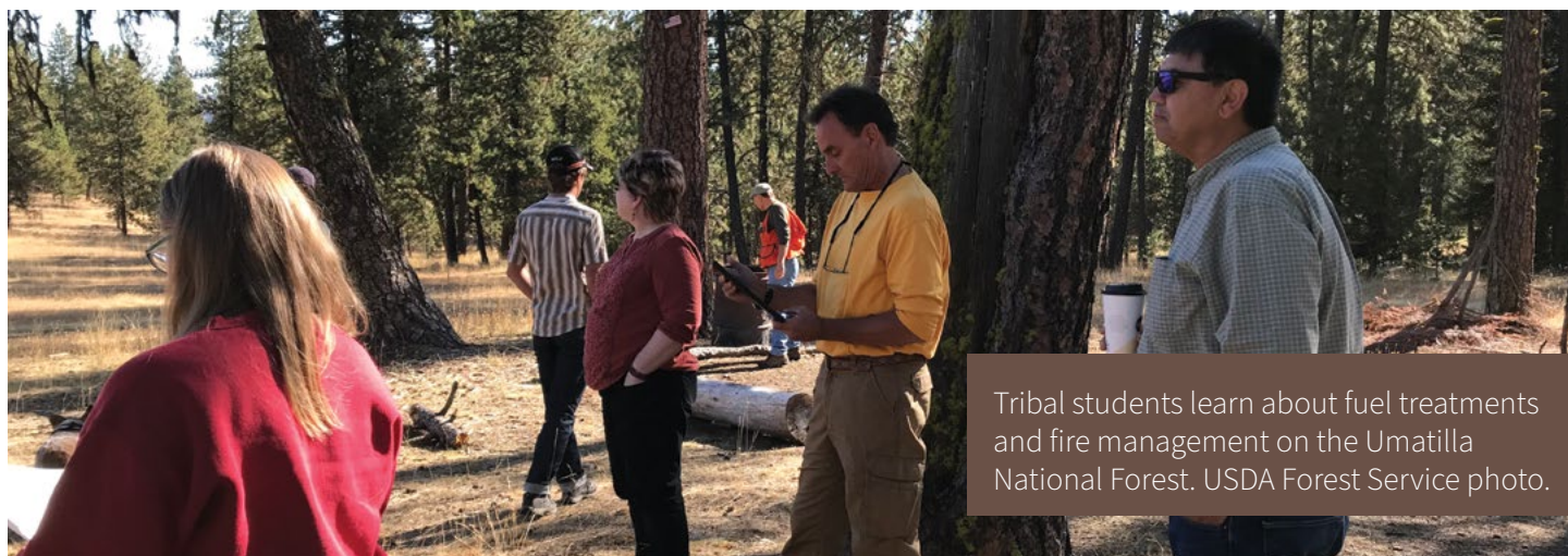
Tribal students learn about fuel treatments and fire management on the Umatilla National Forest.