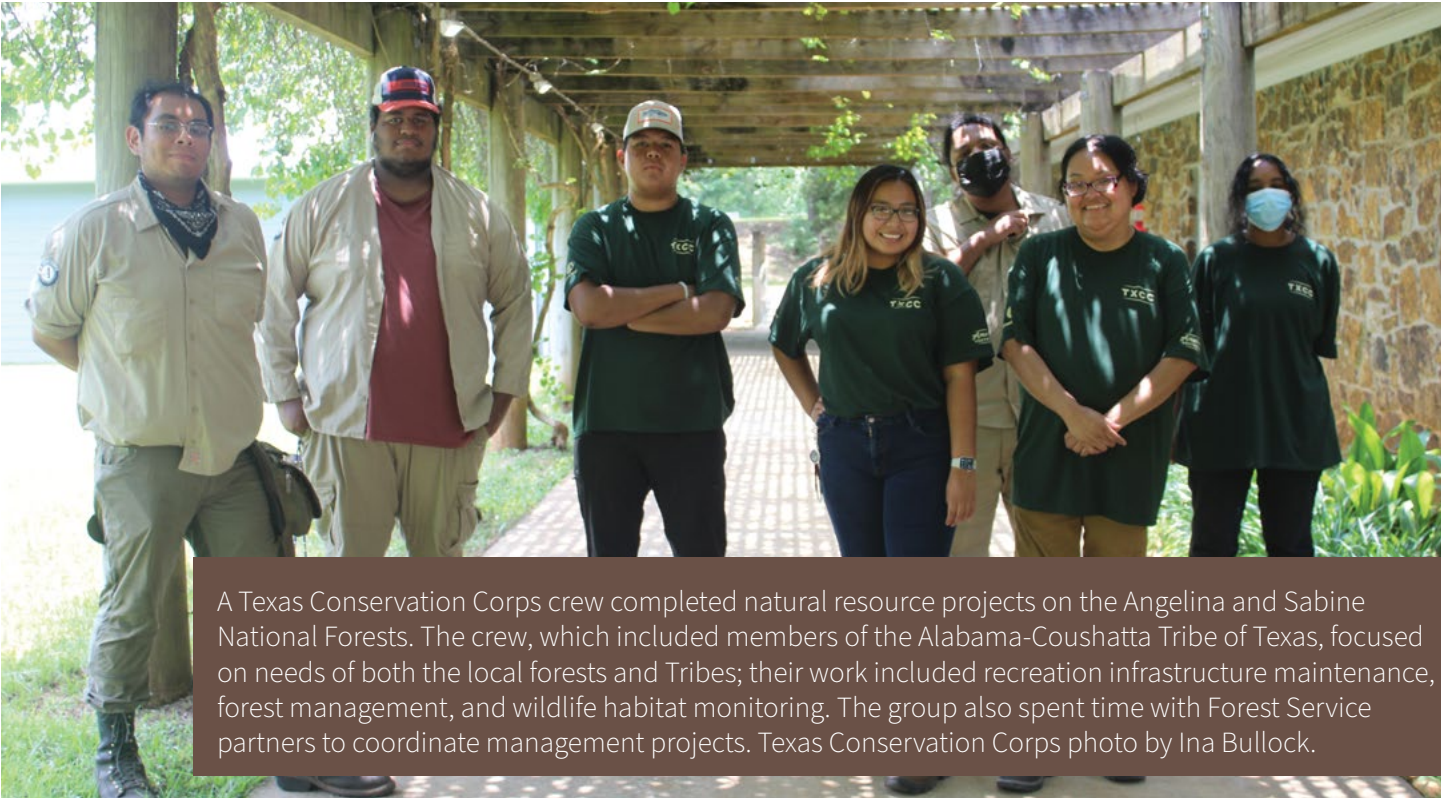
A Texas Conservation Corps crew completed natural resource projects on the Angelina and Sabine National Forests. The crew, which included members of the Alabama-Coushatta Tribe of Texas, focused on needs of both the local forests and Tribes; their work included recreation infrastructure maintenance, forest management, and wildlife habitat monitoring. The group also spent time with Forest Service partners to coordinate management projects.