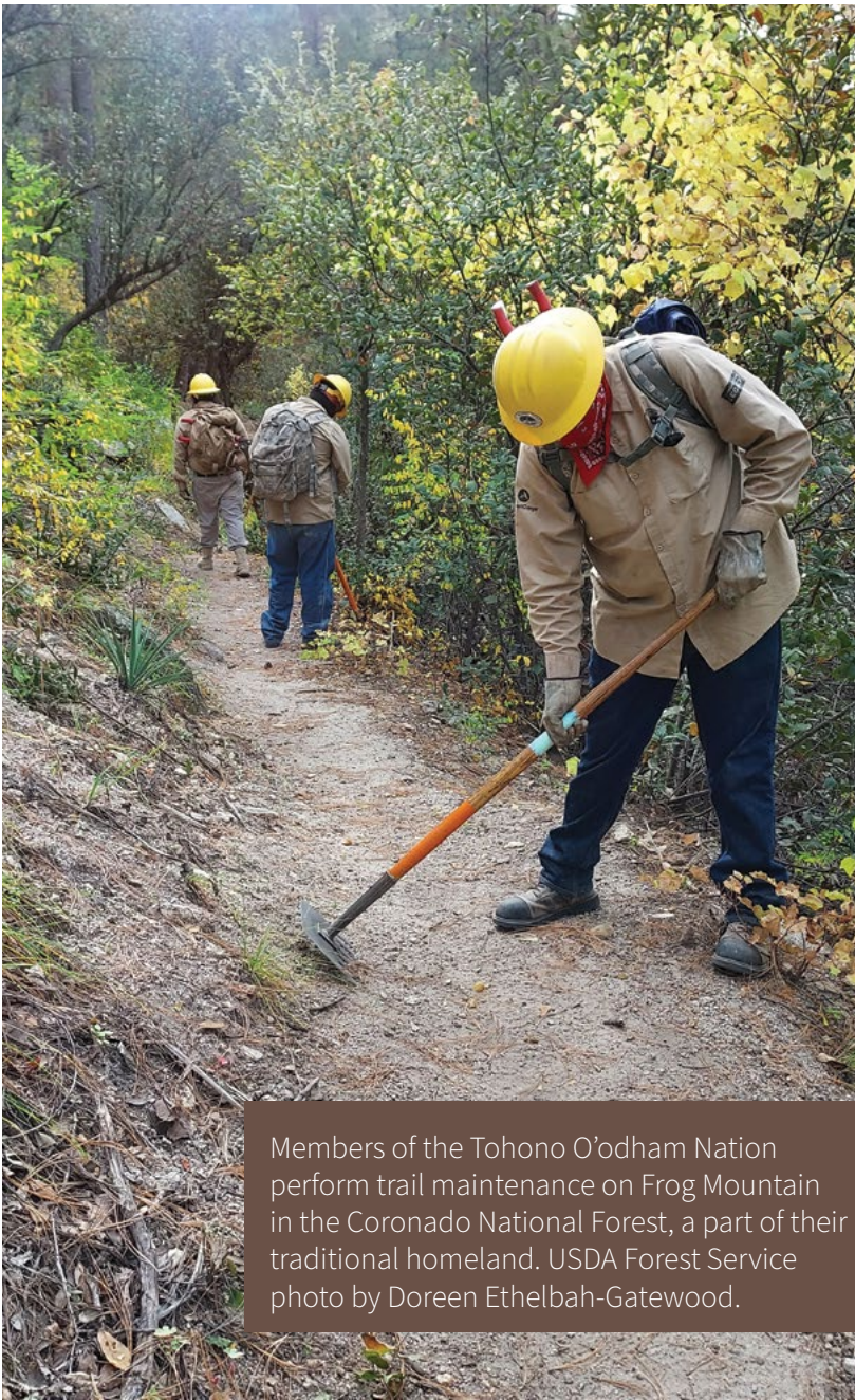
Members of the Tohono O’odham Nation perform trail maintenance on Frog Mountain in the Coronado National Forest, a part of their traditional homeland.