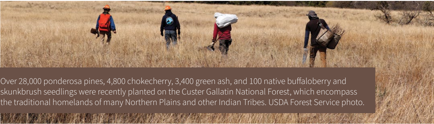
Over 28,000 ponderosa pines, 4,800 chokecherry, 3,400 green ash, and 100 native buffaloberry and skunkbrush seedlings were recently planted on the Custer Gallatin National Forest, which encompass the traditional homelands of many Northern Plains and other Indian Tribes.

The agency is hiring additional full-time permanent Tribal relations staff who meet competencies as outlined in the USDA Recruiting and Hiring Tribal Relations Positions Advisory. OTR partners with deputy areas, regions, and stations to assess and analyze existing Tribal relations-related positions, identify methods to strengthen, support, and improve the agency’s Tribal Relations Program, and define strategies to recruit candidates from diverse backgrounds in a manner that is equitable, inclusive, just, and accessible. OTR also plans to expand its staffing.