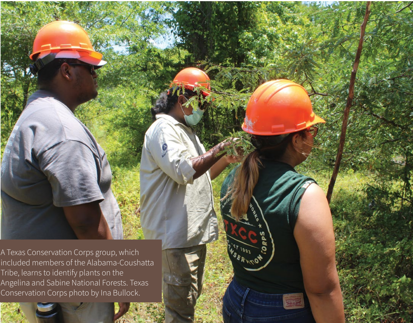
A Texas Conservation Corps group, which included members of the Alabama-Coushatta Tribe, learns to identify plants on the Angelina and Sabine National Forests.