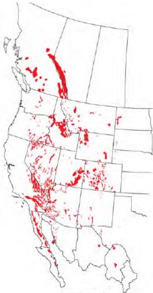
Bighorn sheep distribution map (2012) -

and goats on private and public lands, and the susceptibility of bighorn sheep to diseases harbored by domestic sheep and goats, it is impossible to completely remove all risk of pathogen transmission. UDWR fully understands and accepts the risks of disease in bighorn sheep populations, and will employ a variety of strategies to manage around this risk to ensure sustainable populations of bighorns can exist in balance with domestic sheep grazing.” Thus, considering this and the rationale provided above, these bighorn sheep are likely to be maintained through the various management strategies and techniques employed by the UDWR, including periodic augmentation as well as strategies to minimize risk of comingling between bighorn sheep and domestic sheep.