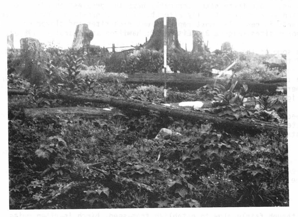
Figure 3. Vegetation development one year after burning in a subhygric site in the SBSj subzone.