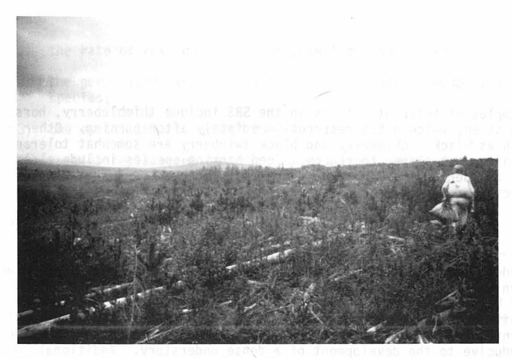
Figure 2. Vegetation development four years after burning in a submesic site the SBSj subzone.