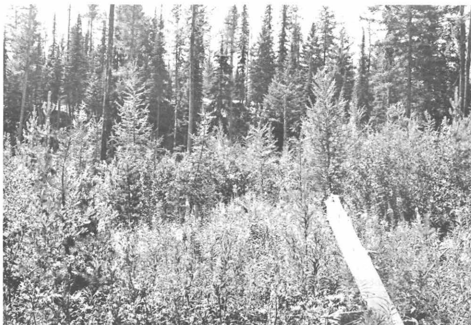
Figure 5. Slash pile site 15 years after burning is still evident by log remains and conspicuous fireweed ( Epilobium angustifolium ). Vigorous conifer saplings ring the burned pocket. Unlogged forest in the background.

In addition to the conifer density differences between the burned and unburned sites, growth rates were compared from randomly selected trees in both locales. The average height and basal diameter of the common trees occurring in the two- and 15-year-old sites are given in Table 2. Differences in the conifer growth rate between the burned piles and adjacent unburned sites were not apparent two years after logging, but had become obvious 15 years later. The overall average height was 3.0