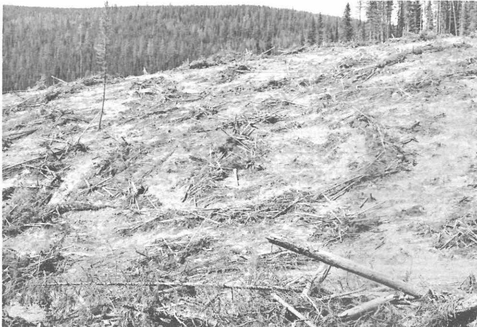
Figure 1. Mission Mountain logging site prepared for fire hazard reduction with the construction of slash piles which will be burned in the fall.