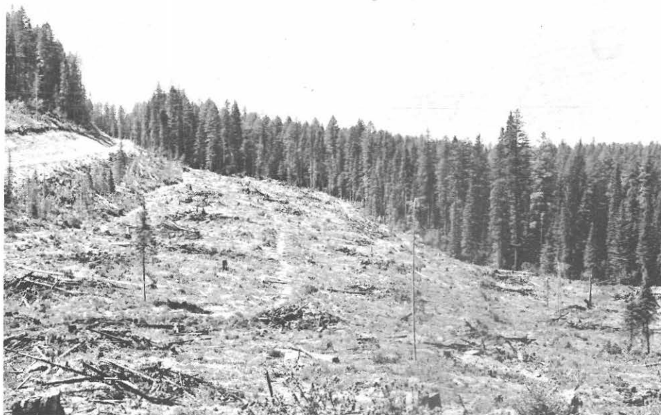
Figure 3. Two years after slash burning, charred logs, stumps, and sparse conifer reproduction mark the former piles.

minimum temperatures recorded at the lower elevation were 91° F and 50° F, and 93° F and 37° F at the higher station. The study area received 133% more precipitation and had 40% less evaporation than the lake site during this month. These measurements support the generalization that the study area was wetter and had more extreme temperatures than the lakeshore locations.