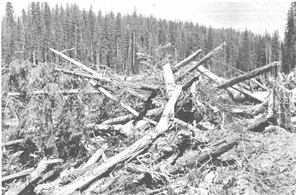
Figure 2. Slash piles are often heaped high with logs, branches, brush, stumps, and litter. These heavy fuels produce extremely hot fires that bake soils and create a deep ash residue.