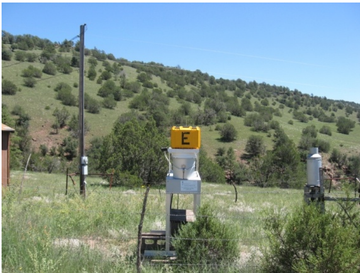
Figure 1. NM01 Atmospheric Deposition Sampling Site.

The National Atmospheric Deposition Program also maintains a monitoring site at the Gila Cliff Dwellings National Monument (Site NM01). This site has been in operation from July 29, 1985, to present.