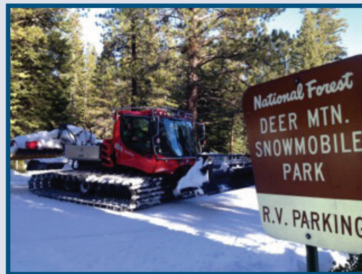
Snowparks are public facilities offered for the enjoyment and shelter of all winter recreationists. Always use caution and be aware of snow grooming equipment!