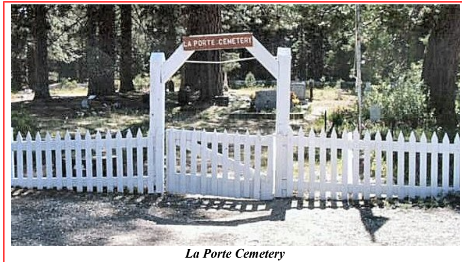
La Porte Cemetery