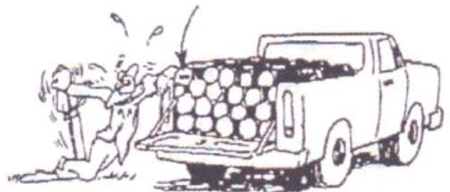
Here's a half-cord load.