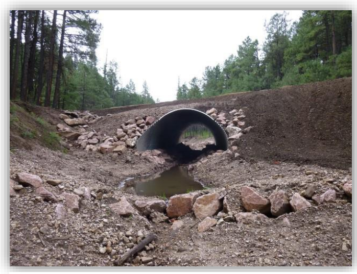
Aquatic Passage Installation

To determine if a project was completed in full compliance with the contract language or treatment guide, we evaluated contract records or interviewed those individuals who were directly or indirectly involved in the inspection and approval of the completed project work. In