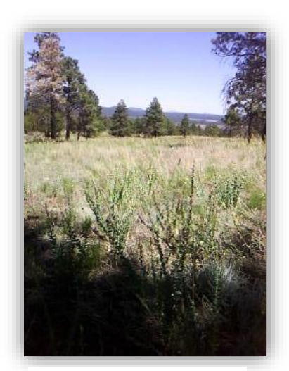
Same area restored through bio-control agents

may reflect changes that are the result of the previous year's treatments. Also, not every treatment is monitored, so those activities that report a value of "no change" do not necessarily represent reality. Nevertheless, when taken as a whole across all years, the average "percent change" value can be a useful surrogate for the effectiveness of treatments. To determine the number of restored acres, we took the total acres accomplished and multiplied it by the average percent change value (which excludes the null values of treatments that were not monitored).