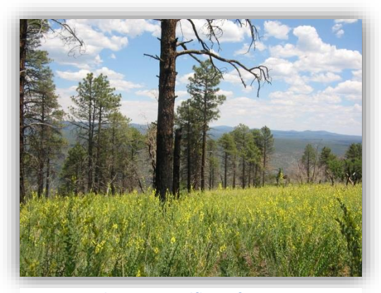
300-acre Dalmatian toadflax infestation

The first desired condition statement is based on the established relationship between increases in native understory cover and diversity and resilience of an area against invasive species establishment. To represent the effects of treatments that improve resilience, we took the vegetation treatments that resulted in canopy cover that is less than 40%. These are the treatments that are expected to result in a significant increase in understory cover.