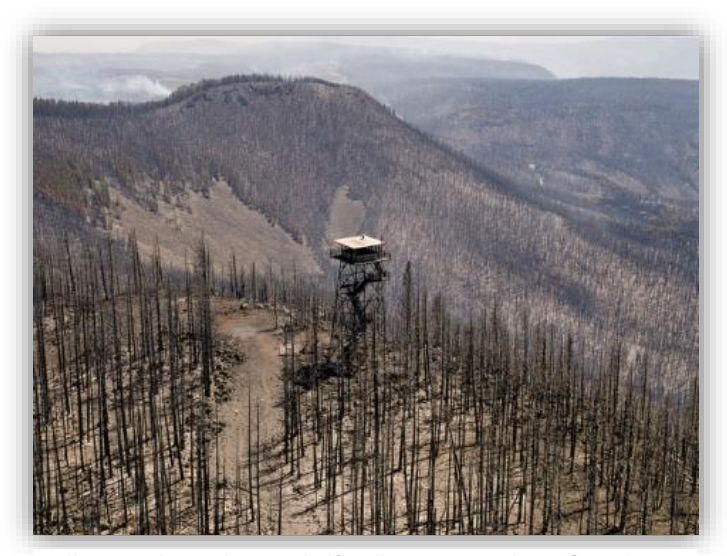
Wallow Fire burned over a half-million acres and significantly set back restoration efforts

Over the last five years, progress has been made despite contractual setbacks and at least one exceptionally destructive wildfire. While wildfires highlight the need for accelerated restoration, they also represent a challenge from