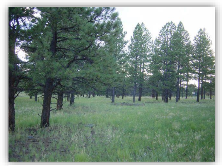
Restored herbaceous cover improves habitat quality for herbivores and raptors alike

A similar process to the one described above was used to capture the effect of treatments on fish and wildlife. Species of interest (derived from TES species) were divided into functional groups based on their preference for either open canopy habitats or closed/mixed canopy habitats. The life history and home range of each species obviously differ significantly. For this reason, we selected 500 meters as a very conservative representation of the distance that an individual may range outside of a treated area (some species may regularly range across several miles) while still benefiting from the improved habitat condition. Based on the best available science, treatments that resulted in a canopy that was less than 40% were categorized as benefitting closed/mixed canopy species. Those that resulted in a canopy cover that was greater than 40% were categorized as benefitting open canopy species. Prescribed fires and wildfires managed for resource benefit were used to represent benefits to closed/mixed canopy