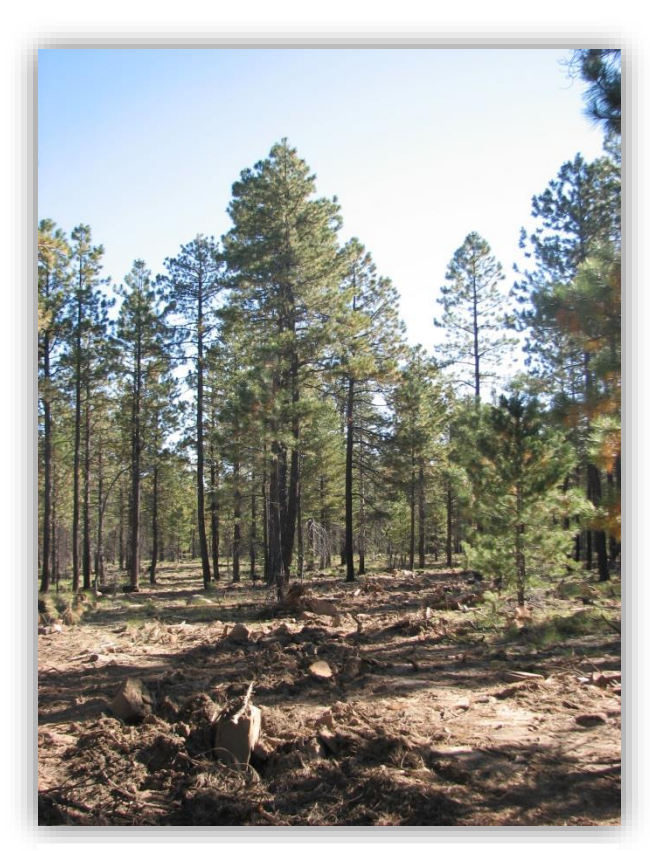
Road Decommissioning improves both habitat and watershed quality

The effects of treatments extend beyond the treatment area boundaries. This is a critical concept to convey, yet it is one of the most challenging aspects associated with reporting outcomes as opposed to simply reporting output. Describing the magnitude and extent of treatment effects requires complex modeling. The resulting values can be either accurate for only a narrow set of conditions or can represent general trends for a much broader set of conditions. In order to succinctly describe landscape-scale effects we used the latter approach. This approach quantifies the critically valuable effects of restoration on the areas surrounding the footprint of individual 4FRI treatments. The specific methods and assumptions associated with calculating each ecological indicator are documented and filed for future