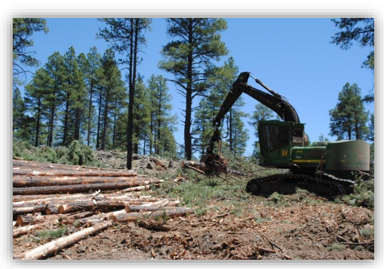
Restoration in Mountainaire

The boundaries for all restoration treatments were taken from the FACTS spatial database and displayed over an aerial photograph. The effect of each treatment was then visually categorized into groups based on canopy cover using a reference image where canopy was digitally calculated. The following assumptions were made based on well-established data derived from years of post-implementation monitoring, modeling, and practical breakpoints that describe broad trends: All treatments were assumed to have raised canopy base height (affects crown fire initiation). However, only those treatments that reduced canopy cover to below 40% were assumed to have reduced the risk of active crown fire. All prescribed fires and wildfires managed for resource benefit were assumed to have raised canopy base height and not to