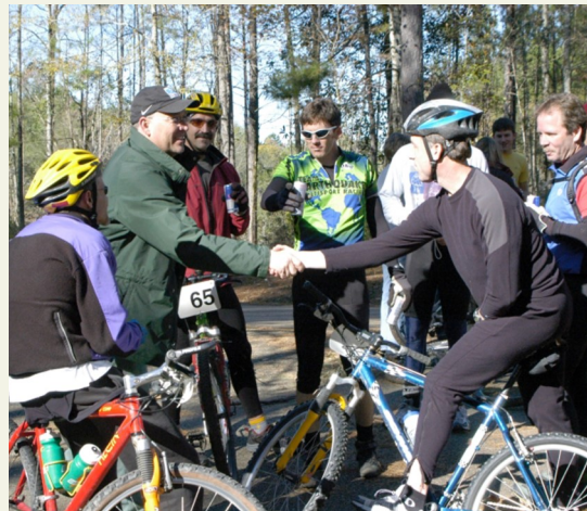
Employees greet mountain biker users on the Long Cane Ranger District, Edgefield, South Carolina.