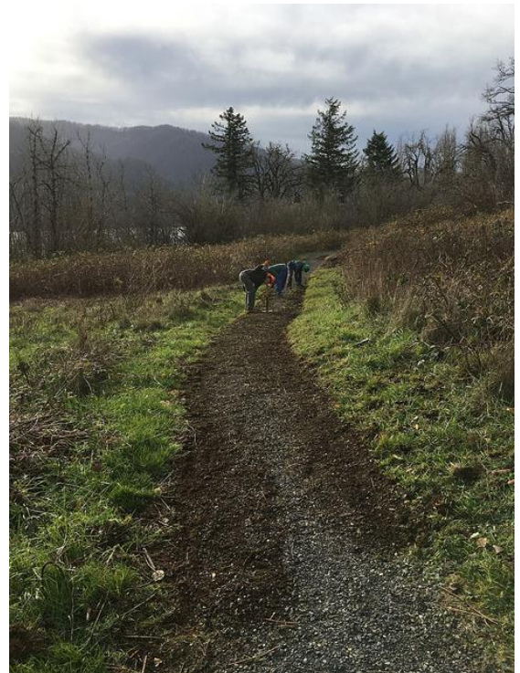
WTA volunteers improving the Sams Walker trail