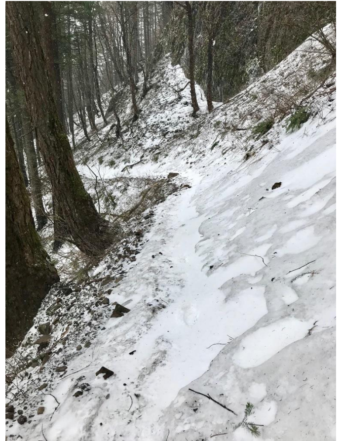
Horsetail Falls trail covered in ice and snow. 2/27/19

Gorge 400- 2/28/19: Expect snow and ice on trail. Wyeth trail is still closed.