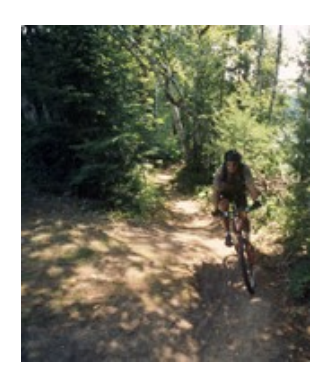
The Tour da Woods ride includes a youth event, Tour da Valley.

from district representatives over the course of the next couple weeks. A recommendation will be presented to the FLT in October so the Forest will be positioned to implement by November.