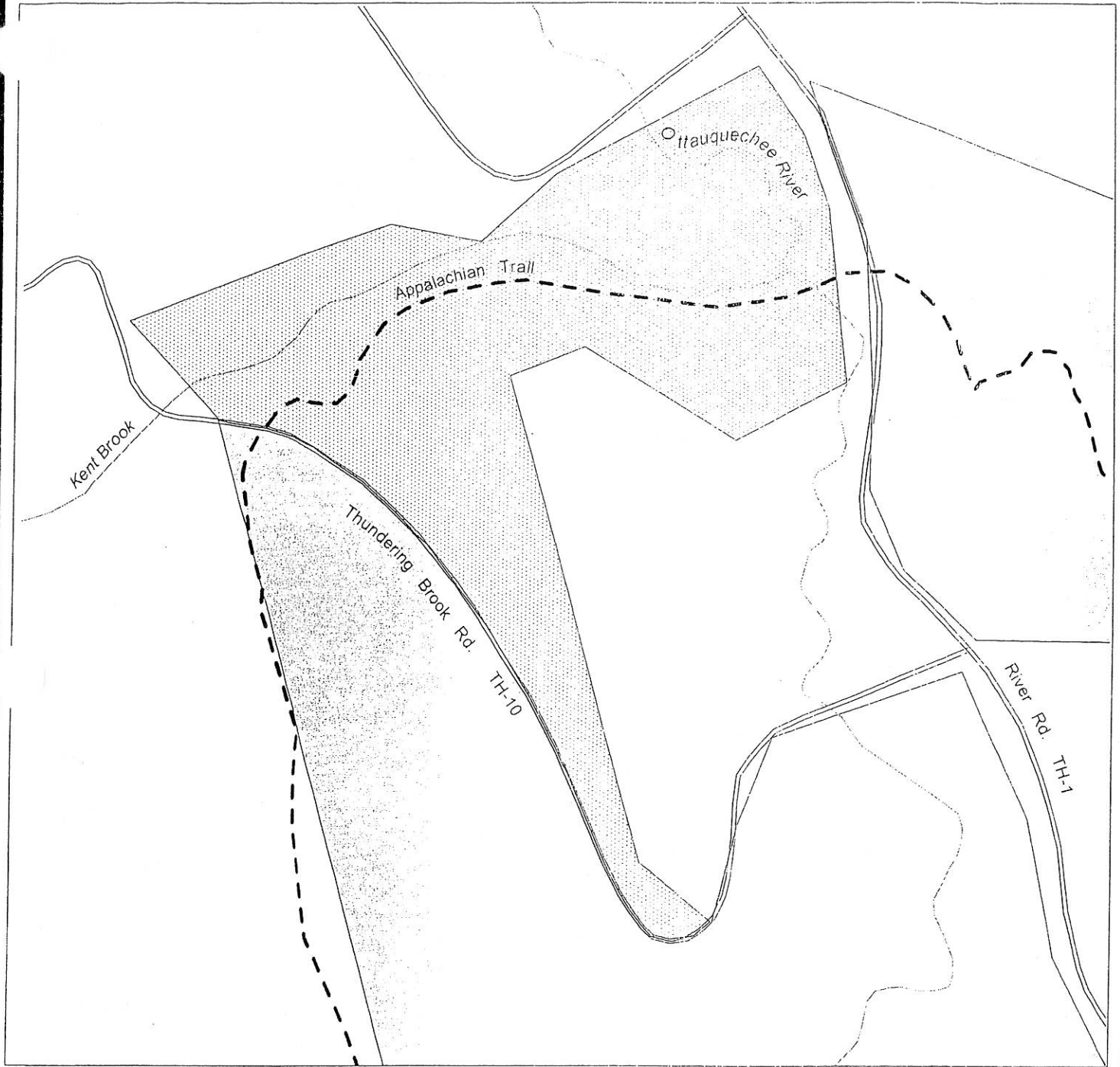
Exhibit A Thundering Falls Closure Order