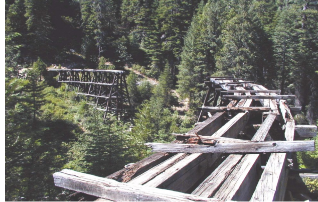
Bourland Trestle, today: photo courtesy of Erin Potter

Gradually, the need for railroads to transport timber gave way to more modern methods, principally truck transport from harvest site to mill. In stages, the railroads were taken apart in a methodical reversal of their painstaking creation.