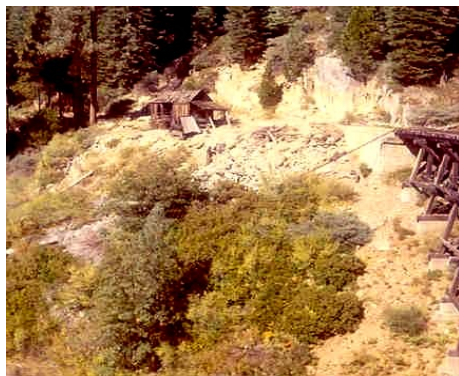
At Bourland, a watchman's cabin stood beside the trestle until it burned in the early 1980's

The trestle was part of the Westside Lumber Company system, operating between 1900 and 1960. West Side rails eventually reached 70 miles of mainline track and 250 miles of branch lines, spur grades and sidings. Built about 1922, Bourland Trestle was located 43 miles from the mill in Tuolumne City. The trestle stood 315 feet in length and 76 feet high. The fire danger was great for these large timber trestles. West Side Railroad kept a watchman at all the major bridges to watch passing trains and check for flying sparks.