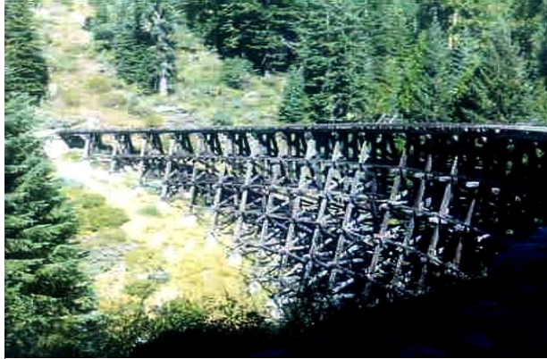
Bourland Trestle, 1970

Bourland Trestle is a well-known, narrow gauge logging railroad trestle in the Stanislaus National Forest. Trestles were vital links in the railroad logging chain. If these trestles were damaged or destroyed, logging and sawmill operations could come to a standstill until the necessary repairs were made. The remains stand as visible reminder of a richly historic period when lumber was “king” and the railroad a vital “queen” necessary for bringing lumber to sawmills after harvest. At the end of a pleasant drive, hike or bike, stop by the Bourland Trestle for a beautiful mountain picnic as your reward.