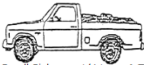
Small Pickup -- 1/4 ton = 1 Tag

The following are examples of loaded trucks and number of firewood tags that might be needed.