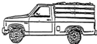
Long Bed Pickup -- 1/2 to 3/4 ton = Tags 2