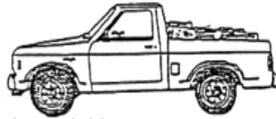
Short Bed Pickup -- 1/2 to 3/4 ton = 1 Tag