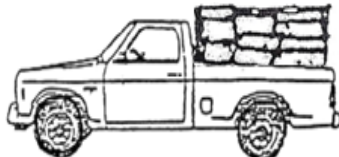
Long Bed Pickup -- 1/2 to 3/4 ton = 2 Tags