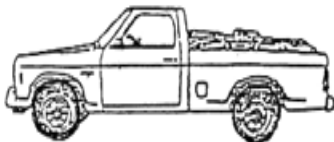
Long Bed Pickup -- 1/2 to 3/4 ton = 1 Tag