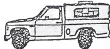
Long Bed Pickup---- 1/2 to 3/4 ton = 2 Tags