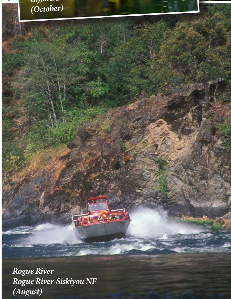
Rogue River Rogue River-Siskiyou NF (August)

Another round of beautiful places wraps up this quarter's photo contest with outstanding scenery from throughout Washington and Oregon.