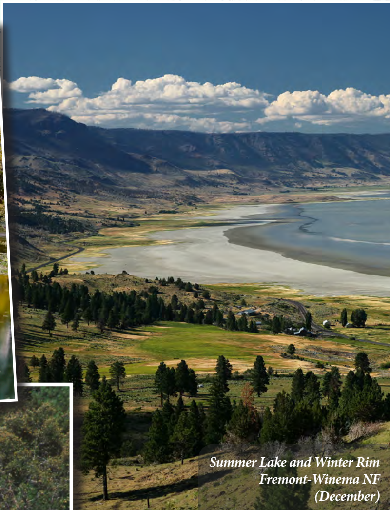
Summer Lake and Winter Rim Fremont-Winema NF (December)