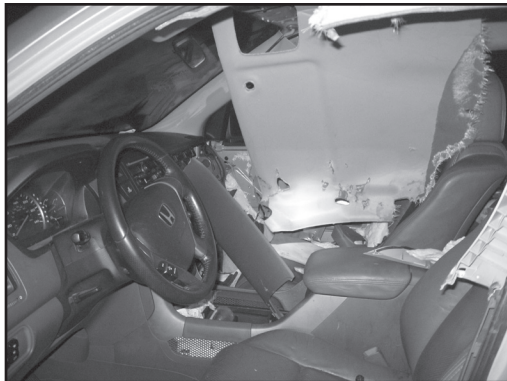
ATTRACTING BEARS TO YOUR VEHICLE CAN RESULT IN THOUSANDS OF DOLLARS IN DAMAGE. ROLL UP YOUR WINDOWS, LOCK YOUR DOORS AND DON'T LEAVE FOOD OR ATTRACTANTS IN YOUR CAR.

If you're driving your car or RV to a remote, undeveloped site in the forest, please read our Camping and Hiking in Bear country brochure. Food and other items with odors should still be stored in bear-resistant containers or hung properly. Keep windows and doors closed and locked at all times. Don't leave anything that a bear might associate with food in view, such as coolers or grocery bags, even if there is no food in them. A bear may recognize them as objects that usually have food and be willing to break into your vehicle in hopes of getting a reward.