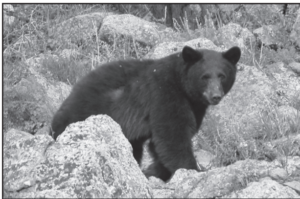
© ESTES PARK TRAIL GAZETTE/BEAR IN ROCKS (HAZELTONS)

Whether you're camping in a reserved campsite in a park or forest, or an undeveloped site off the beaten path, if you're west of I-25, you're camping in black bear country. Nobody wants to lose a week's worth of food to a foraging bear or wake up in the middle of the night to the sounds of a bear exploring their camp. Choosing a smart campsite, properly locating your cooking, eating and food storage areas, keeping a clean camp and storing your food and other items with odors in a bear-responsible way can help you avoid attracting bears.