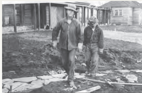
CCC masonry workers used stone taken from a nearby quarry for the walkways and retaining walls at the Fenn Ranger Station.