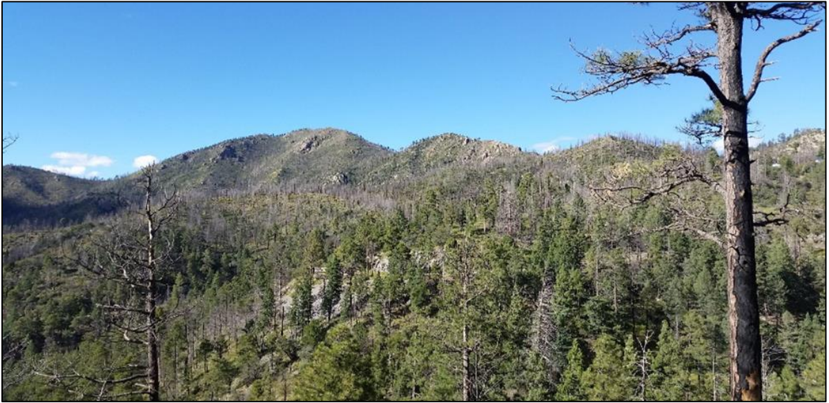
View of Southern Black Range, Aldo Leopold Wilderness