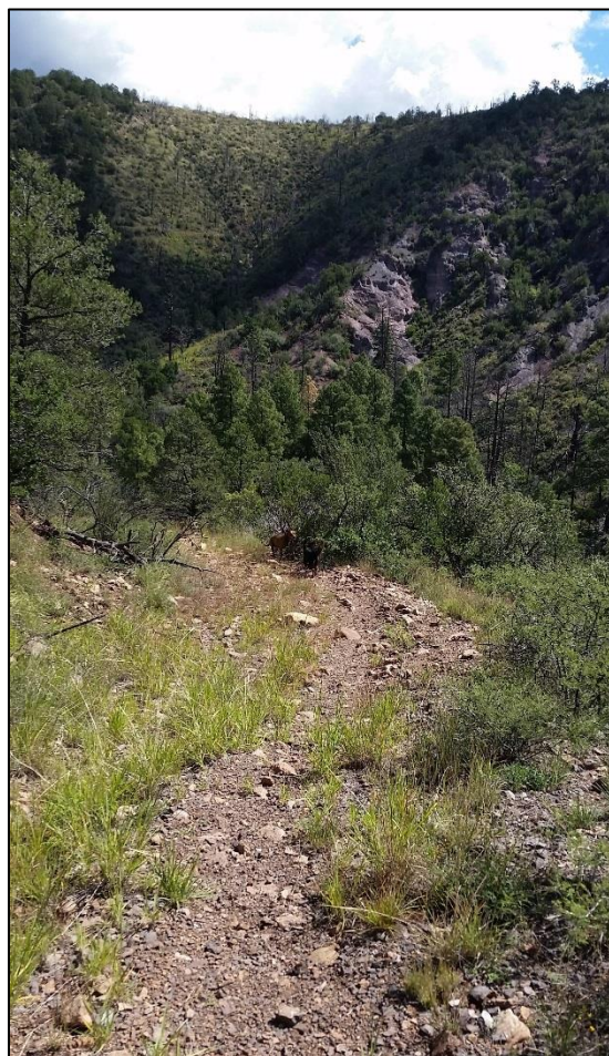
Rain Creek Trail, Gila Wilderness

Common themes that were identified across a range of participants throughout the meetings were considered when developing the Gila National Forest definition of “substantially noticeable”: