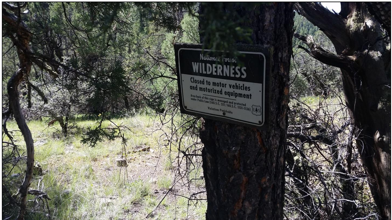
Continental Divide National Scenic Trail in Rocky Canyon, Gila Wilderness