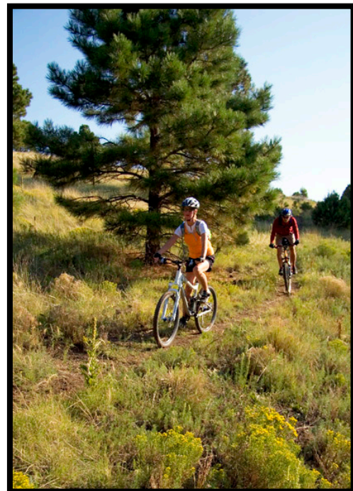
Figure 2 – Bikers coasting downhill along the trail.

As always, let someone know before you go.