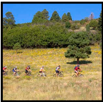
Figure 1 – Bikers enjoying one of the 5 trails

The area is open all year but snow and icy conditions may be present in the winter months. Trails in this area are considered moderate difficulty for mountain bikes due to steep climbs and descents with narrow treads. It is considered easy difficulty for hiking and horseback riding. There are no corrals for horses or other pack animals in the area.