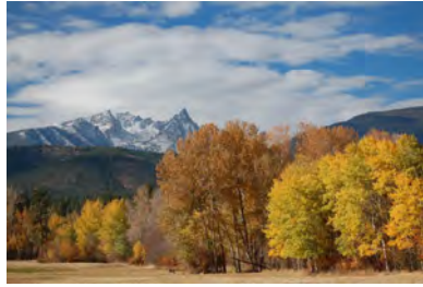
Near Conner, MT