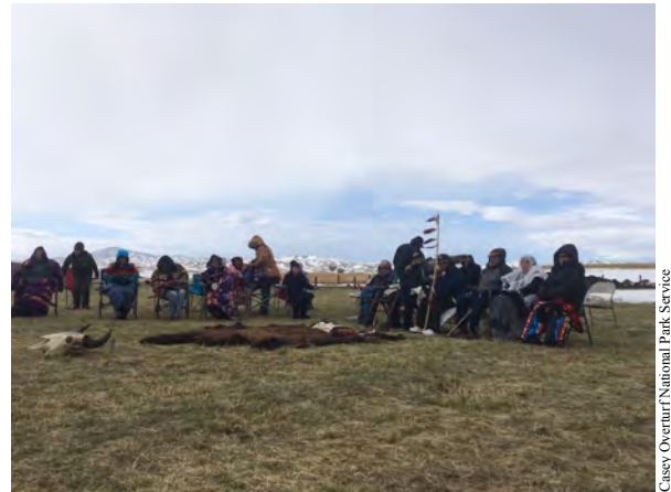
Casey Overturf/National Park Service

Warming weather helped with the melt but we still need to plow the roads and clear the area for commemoration. The National Park Service (NPS) crew got to shoveling and sweating with gusto. The childhood method of rolling big balls of snow was even employed to clear space for commemoration. The hard, wet, and cold work was enjoyed by all, perhaps because it was such a tangible form of service which we do not always get to experience.