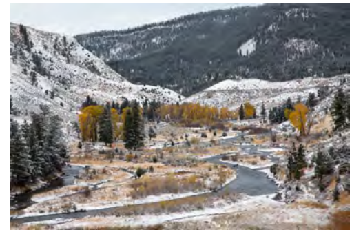
October snow visits Yellowstone Park.