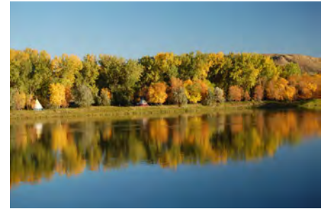
Missouri River, Fort Benton, MT