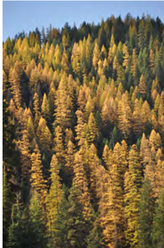
Larch along Lolo Creek, MT