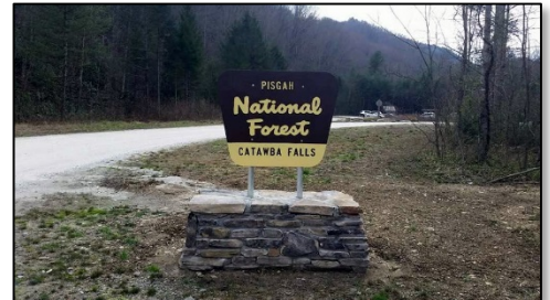
New portal sign at Catawba Falls

The popular Catawba Falls came into Pisgah National Forest management in 2009. Since then the Forest has built a parking lot and restroom has been making significant improvements on the access trail. In 2016, the Forest installed a portal sign using about $1,500 of recreation fee funds to identify the trailhead area. This "all local" project showcased a sign that was hand-routed in the work center machine shop with a base built from local rocks.