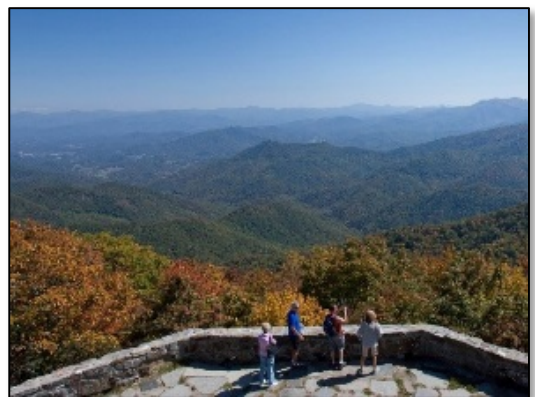
Visitors overlooking the Nantahala National Forest from the Wayah Bald observation platform