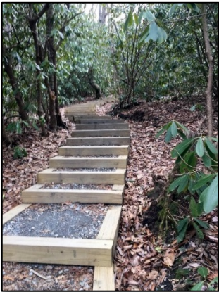
New steps at Whiteside Mountain Trailhead

The Nantahala National Forest replaced 250' of steps at the Whiteside Mountain trailhead, which takes visitors to the top of Whiteside Mountain where 700' cliff walls offer amazing views. The Forest used about $22,000 of recreation fee revenue to match a State trail grant for the project. In addition to the construction of steps, the Forest repaired the roadbed to keep water off the trail, which required 20 tons of gravel and heavy equipment rental.