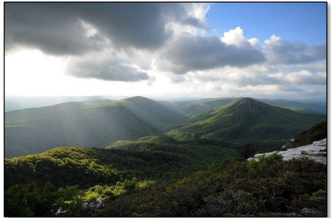
View of the Linville Gorge Wilderness Area as seen from Table Rock