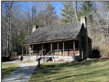
Cradle of Forestry offers glimpses into the early 1900s.