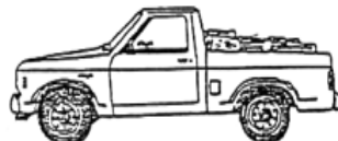
Short Bed Pickup -- 1/2 to 3/4 ton = 1 Tag