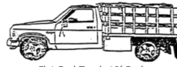
Flat Bed Truck 10' Bed 2' Racks= 3 Tags 4' Racks= 5 Tags 5' Racks= 6 Tags